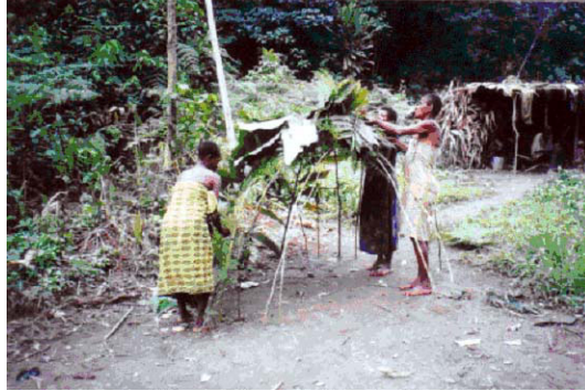
Women demonstrate building Itudi (round hut). The more common form of hut-style can be seen in the background. Babongo-Sango, Diyanga, Mount Ibounji, 1998.

powerless' and 'omnipotent fetishers,' and, like other Gabonese, go on to elucidate its meaning in relation to the term 'Bantu.'