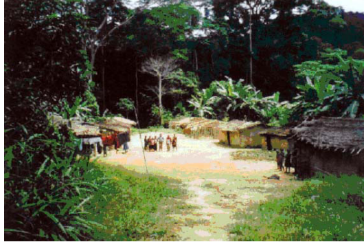
Forest Settlement, Mukingami, Babongo-Tsogho, Mount Iboundji, 1998

Some Forest Peoples reported that, in 1990, they were ordered to move from the forest to the road in order to contribute to the electorate. They described how Bantu candidates running for elections often call upon Pygmies for their vote and use previous master-servant relationships as a means to gain their support (personal fieldwork, 2002).