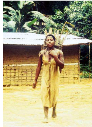
Gathering Firewood: Babongo-Tsogho, Boundji, Etéké Forest 1997

As is so common throughout Central Africa, the term also carries with it the double identity of the Pygmies as 'nothing' (numerous derogatory connotations, lower status) and 'everything' (healers and fetishers that know the secrets of nature). They themselves use the word with outsiders as a form of self-description, interchangeably with such local terms as 'Babongo,' again in contexts that emphasise their dual identity as 'small and