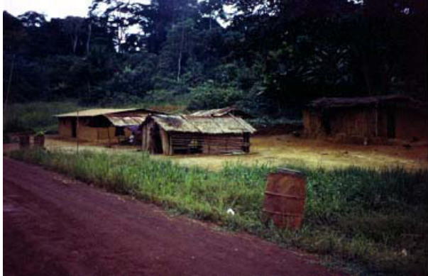
Babongo-Akélé Quartier in roadside regroupement, Manamana, Lastoursville 1998