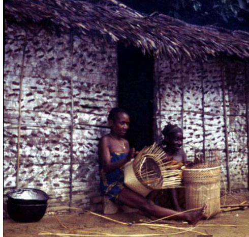
Basket Making: Babongo-Tsogho, Mugoko, Etéké Forest 1997