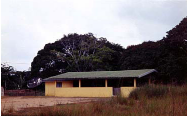
Babongo-Téké roadside settlement, Kebaga, State funded buildings, Haut Ogooué, 2002

Groups have different hunting techniques: in Lastoursville and Lebamba, for example, Babongo groups carry out communal net hunting (both sexes), whereas in Etéké they do not. Amongst the northern and southern groups, they described the great elephant hunt; while in the central area around the Massif du Chaillu, some groups claimed to have a taboo against eating elephant (possibly a clan taboo rather than representative of the whole community). In Lastoursville, some of the older members continue to use traditional bows and poisoned arrows, but in the majority of instances these have been superseded by guns, often loaned out, with bullets, by neighbouring ethnic groups to specialist Babongo hunting partners in exchange for a high quota of bushmeat. Trapping devices are ubiquitous and used by both men and boys to catch a variety of small to medium sized mammals. Fishing and crab-catching are also common.