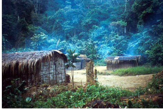
Forest camp, Veda, Babongo-Tsogho, Etéké Forest 1997

In theory, within most areas of Gabon clear felling is not practised. Logging is generally selective, involving 1-2 trees per hectare (WCS and Ecofac, 2002 – personal communication). However, management plans are poorly monitored especially where areas are sold as temporary short-term concessions (Permis Temporaires d'Exploitation). In the majority of the country, companies holding concessions are investing efforts in developing Gabon's infrastructure, most notably roads and railways. Thus, large stretches of previously inaccessible forest have been opened up to the commercial bushmeat exploitation to satisfy the demands of the urban sector.