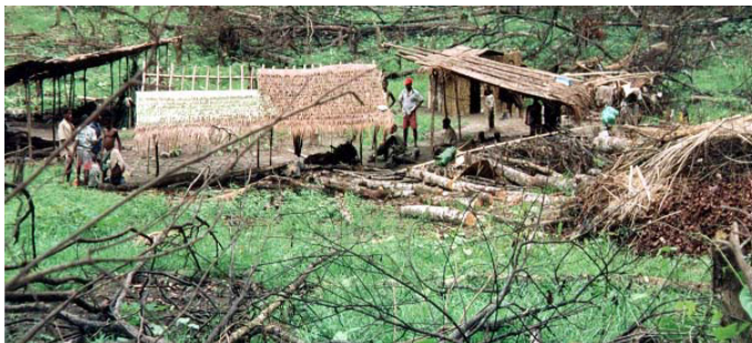
Forest camp, Nganzi, Bagama, Mambi, Mayumba Forest, 1998