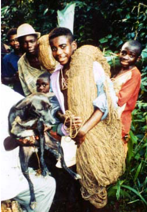
Men returning from the hunt. Babongo-Nzebi, Mtai Mtzingui 1998

Congo Basin; and only 1% of the land is cultivated (Ecofac, 2002 – personal communication). To the East of the country, forest gives way to savannah producing the stunning ‘postcard’ landscapes to be found in the Lopé reserve and Batéké plains of Haut Ogooué. Forest Peoples are found today in every one of Gabon’s provinces.