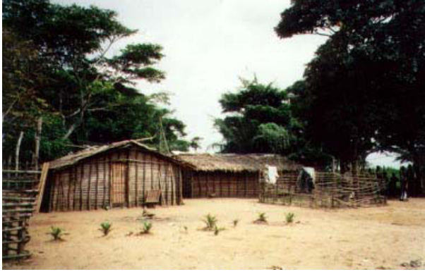
Babongo-Téké roadside settlement, Kebaga. Traditional Téké-style architecture, Haut Ogooué, 1998

Babongo owned chickens they had received them as payment for working in neighbouring Batéké fields. Occasionally, Babongo villages had adopted agriculture, but rarely to a sufficient extent to satisfy their needs. Other Babongo villages were located by the road at varying distances (as much as ten kilometres) from the neighbouring chief's village. A few consisted of rectangular huts built in the style of their neighbours although village layout was less orderly. In the case of the Babongo based in roadside settlements, Anderson notes that they also had temporary camps at other sites away from the road, where they would go and hunt in the dry season.