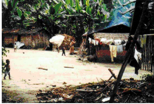
Forest Settlement, Baka, Oveng Alene, Minvoul 1998