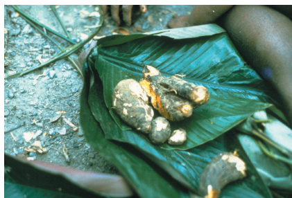
25. Dioscorea smilacifolia (#182) (2)