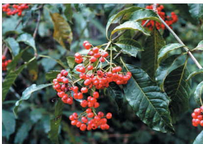
18. Rauvolfia vomitoria (#65) (1)