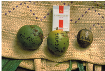
32. I. robur (left), I. wombulu (#273, middle), I. gabonensis (#271, right) (2)