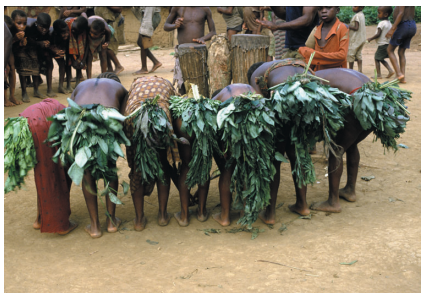
9. Dancing girls wearing green plants (1)