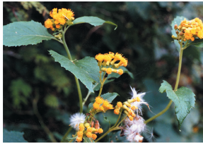
22. Crassocephalum bumbense (#138) (1)