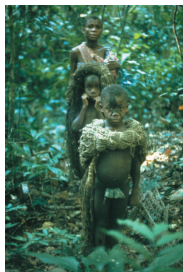
6. Roasted plants smeared for a hunting luck (2)