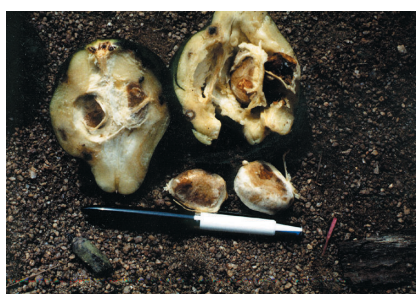
54. Edible fruit of Chytrathus mortehanii (#543) (1)