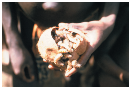
27. Anaphe sp. feeding on Brideria micrantha (#202) (2)