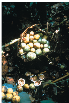
17. L. owariensis (#55) (2)