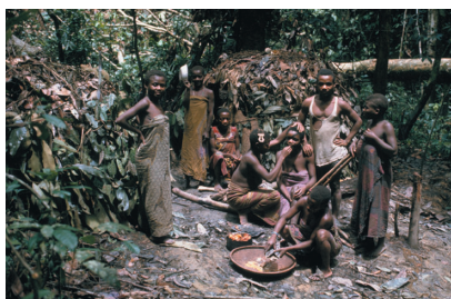
5. Mbuti camp full of useful plants (2)