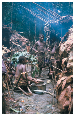
2. A joyful camp life (2)