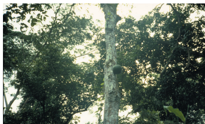
46. Treculia africana Decne (#425) (2)