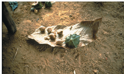
26. Tetracarpidium conophorum (#226) (2)