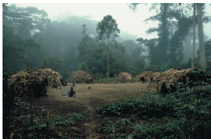
1. Mbuti camp in a morning mist (2)