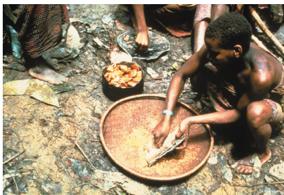
34. Grating the beans of G. dewevrei (2)