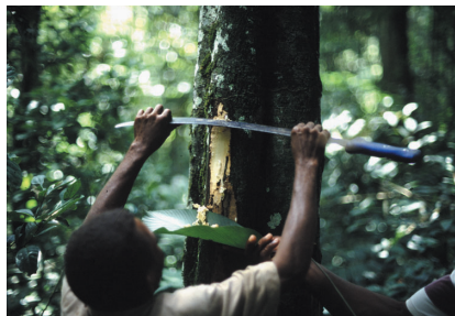
12. Collecting bark powder for medicine (1)