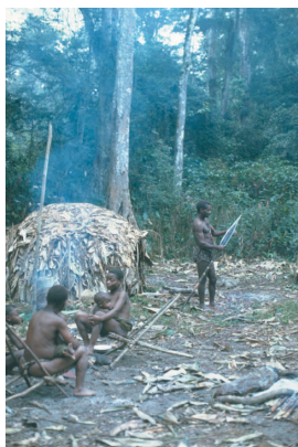
3. Preparing for a big game hunt (2)