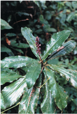
21. Palisota hirsuta (#129) (1)