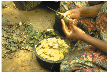
24. Dioscorea bulbifera (#176) (2)