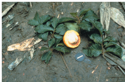
16. Landolphia jumellei (#54) (2)