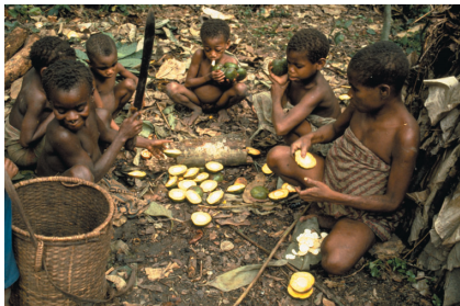
31. Irvingia robur (#272) (2)