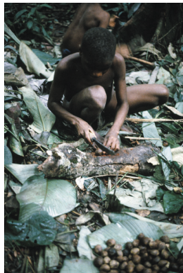
10. Edible nuts of Antrocaryon nannanii (#26) (1)