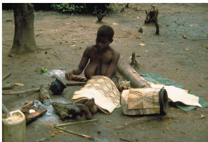
45. Barkcloth made of Ficus sp. (2)