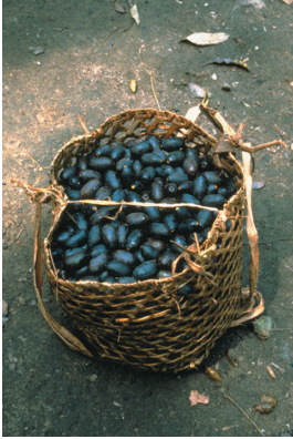
19. Canarium schweinfurthii (#103) (2)