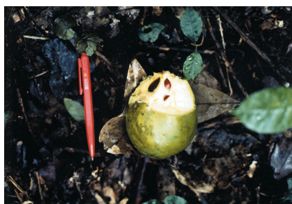
57. Edible fruit of Tieghemella africana (#560) (1)