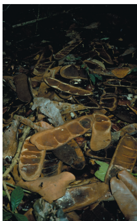
33. Pods of Gilbertiodendron dewevrei (#287) (2)