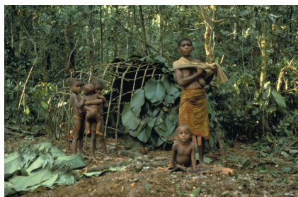
41. M. macrostachyum leaves for thatching (2)