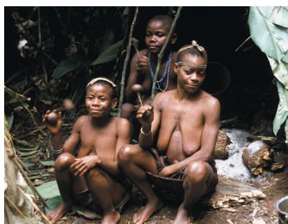
30. A musical instrument made of Oncoba spinosa (#235) (1)