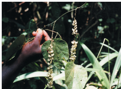
44. Stephania sp., a plant with magical power (#386) (1)