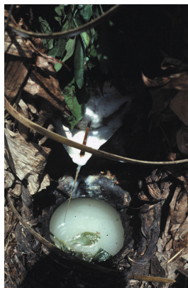
48. Palm-wine from Raphia sp. (#458) (1)