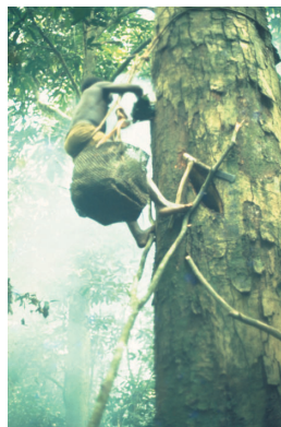
4. Honey collecting in the forest (2)