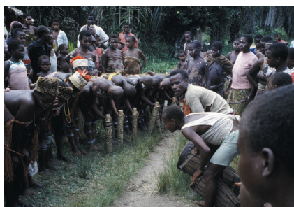
29. Sticks made of Ricinodendron heudelotii (#222) (1)