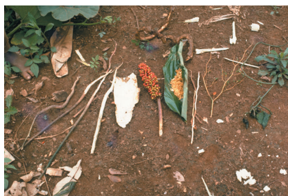
11. Plants for arrow poison, mutali (#465) (2)