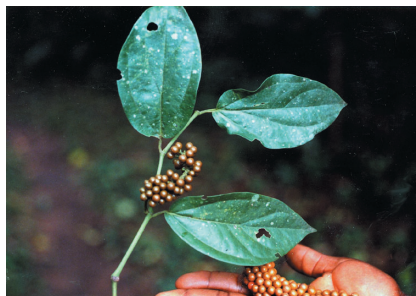
50. Piper guineense (#468) (1)