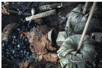
39. Bellows made of Megaphrynium macrostachyum (#350) (1)