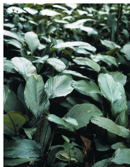
38. Ataenidia conferta on the forest floor (#338) (1)