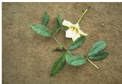
52. Rothmannia whitfieldii (#511) (2)