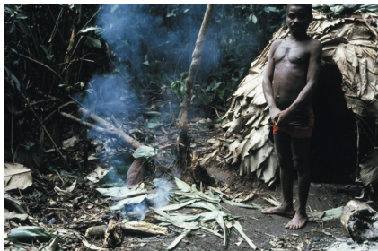
7. Burning leaves for preventing the rain (1)