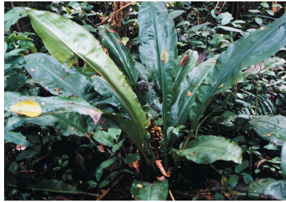
20. Palisota ambigua (#128) (1)