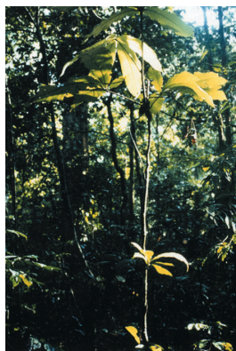
14. Uvariopsis congolana (#41) (1)