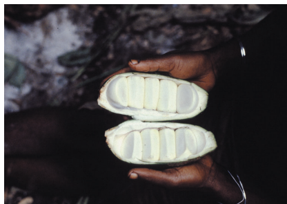
58. Cola acuminata (#578) (1)