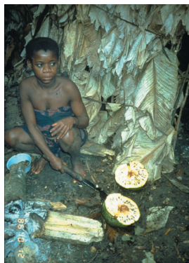
47. Extracting the seeds of T. africana (#425) (2)