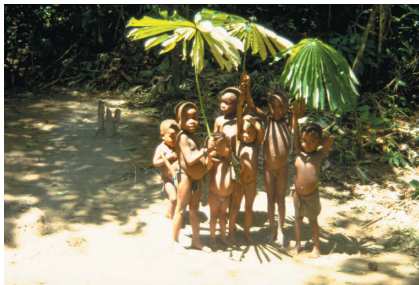
43. Playing with leaves of parasol tree (#421) (2)