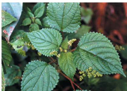
59. An edible herb, Fleuya ovalifolia (#611) (1)