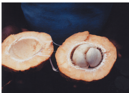
15. Fruit of Dictyophleba ochracea (#52) (1)