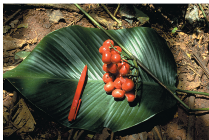
40. Megaphrynium macrostachyum (Benth.) K. Schum (#350) (2)