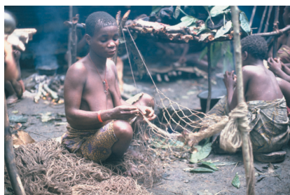
28. Hunting nets made of Manniophyton fulvum (#215) (2)