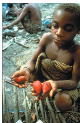
60. Aframomum sanguineum (#643) (2)