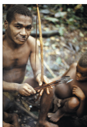
51. A bow of Aidia micrantha (#478) (1)