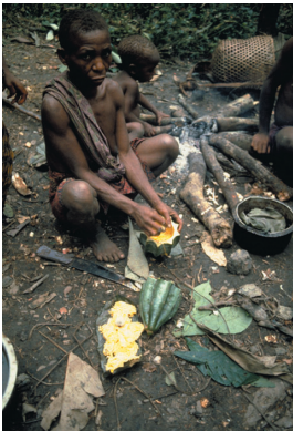
23. Telfairia occidentalis (#167) (2)