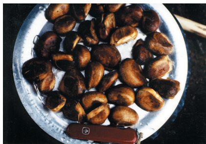
55. Seeds of Chytrathus mortehanii (#543) (1)