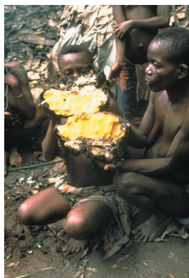
13. Fruit of Anonidium manii (#31) (2)