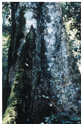
36. Julbernardia seretii (#288) (1)