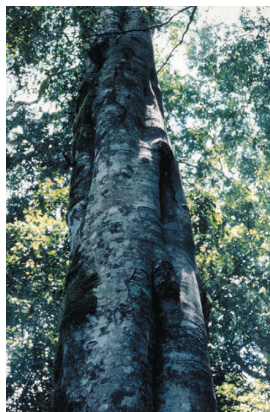
35. Cynometra alexandri (#284) (1)