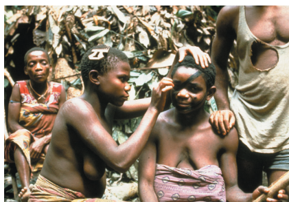
53. Face-painting with the R. whitfieldii juice (#511) (2)