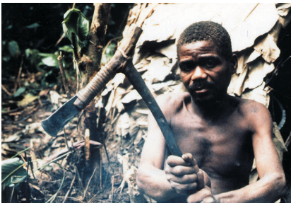
8. An axe for honey collecting (1)