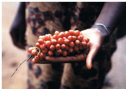
42. Fruits of Dioscoreophyllum cumminsii (#382) (1)