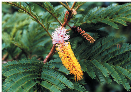
37. Dichrostachys cinerea platycarpa (#298) (1)