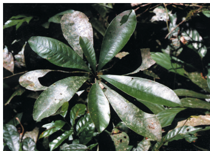
56. Bequaertiodendron congolense for arrow feathers (#552) (1)