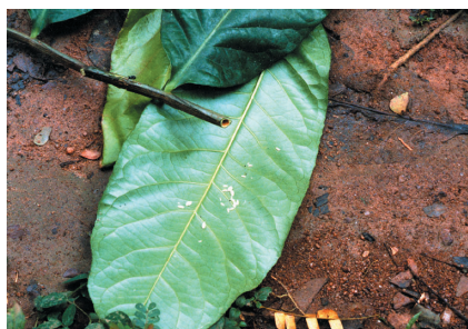
49. Barteria fistulosa with eggs of ants (#463) (1)