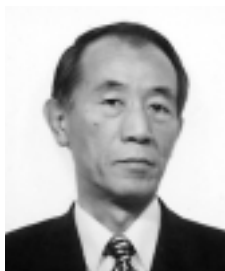
Prof SHINJO, Teruya (D Sc)

By using vacuum deposition method, artificial multilayers have been prepared by combining various metallic elements. The recent major subject is an interplay of magnetism and electric transport phenomena such as the giant magnetoresistance effect. Fundamental magnetic properties of metallic multilayers have been studied by various techniques including Mössbauer spectroscopy using Fe-57, Sn-119, Eu-151 and Au-197 as microprobes, and neutron diffraction. Microstructured films such as wires and dots were successfully prepared by electron-beam lithography and novel magnetic and transport properties are investigated.