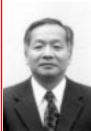
Prof KOHJIYA, Shinzo (D Eng)

Attempts have been made to elucidate the molecular arrangement and the mechanism of structural formation/change in crystalline polymer solids, polymer gels and elastomers, polymer liquid crystals, and polymer composites, mainly by electron microscopy and/or X-ray diffraction/scattering. The major subjects are: synthesis and structural analysis of polymer composite materials, preparation and characterization of polymer gels and elastomeric materials, structural analysis of crystalline polymer solids by direct observation at molecular level resolution, and in situ studies on structural formation/change in crystalline polymer solids.