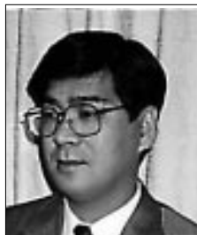
Professor YOKO, Toshinobu (D Eng)

Inorganic amorphous materials with various functions are the targets of research in this laboratory. (1) To obtain a clear view of "what is glass" and the bases for designing functional glasses, we investigate the structure of glasses using X-ray and neutron diffraction analysis, high resolution MAS-NMR, and ab initio MO calculation. (2) To develop materials of high optical nonlinearity, we search heavy metal oxide-based glasses and transition metal oxide thin films, and evaluate the nonlinear optical properties by THG and Z-scan methods. (3) Using sol-gel method, synthesis and microstructure control are carried out on ceramic/metal/organic dye composite thin films.