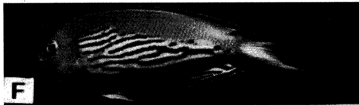
Figure 1. An example of parallel stripe to the antero-posterior axis ( G. watanabei )

Most of the stripes observed on fish skins are either parallel or perpendicular to their antero-posterior axis (Kondo & Asai, 1995). Some species have parallel stripes, some have perpendicular ones, and small number of species has random stripes, where the direction of the stripe is not fixed. For example, very close two species ( Genicanthus melanosphilos and Genicanthus watanabei ) show very different patterns; G. melanosphilos shows perpendicular and G. watanabei shows parallel stripes to the antero-posterior axis. On the other hand, the direction of stripes obtained by simple reaction diffusion systems is basically free. The stripes patterns generated by the reaction-diffusion mechanism in two-dimensional space has stable periodicity (Turing, 1952), however, the direction of the stripe is not stable; that is variable depending on the initial distribution. What makes the strong directionality in the actual fish skin?