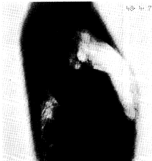
Fig. 2 Lateral view: Abnormal shadow extended as a triangle from the diaphragm to the right hilar region.

Laboratory and X-ray findings: There were no abdominal findings in the blood or urine. Pulmonary function tests showed slightly decreased vital capacity. The abnormal shadow mentioned above was noted on a plain roentgenogram. The lateral view show-