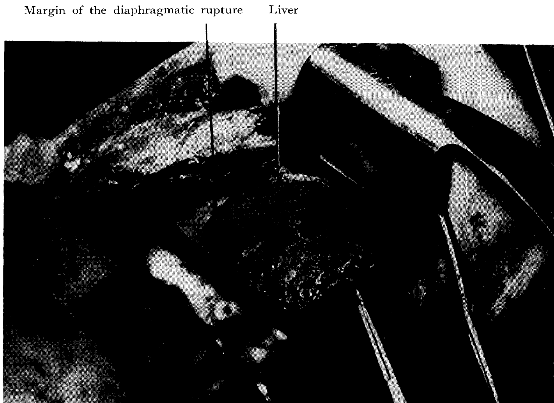
Fig. 4 Liver prolapsed through the traumatic rupture of the diaphragm was observed just under the site of the thoracotomy.