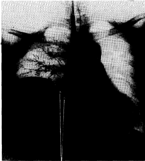
Compressed middle and lower lobe bronchus