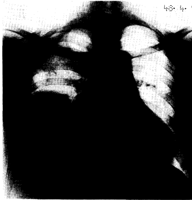
Fig. 1 Plain chest film: Large abnormal spherical shadow was observed in the right lower lung field. But, the patient had been no respiratory symptoms nor had he complained of any digestive discomfort.

were normal. Breath sounds were decreased over the right chest, especially the lower part. The liver-lung border was elevated to the superior margin of the 5th rib. The upper abdominal muscles were tense and the liver could not be palpated.