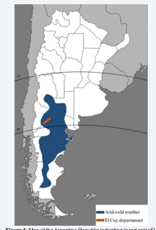
Figure 1: Map of the Argentine Republic indicating in red color El Cuy Department and in blue the Argentinean Patagonia region with a semi-arid-cold climate (Bwk, Köppen classification).

for Investigation in Health, Province of Cordoba. All studies adhered to Helsinki declaration. The studies (non-probabilistic consecutive, transversal / observational) were conducted in El Cuy Department, Province of Río Negro, Argentina. In this area of 11,281 km2, at 750 meters above sea level between 38^{\circ} 56' - 40^{\circ} 25' of south latitude and 67^{\circ} 54' - 69^{\circ} 04' west longitude. According to the last census, 2,329 inhabitants live (1,311 males and 1,018 women. It is worth to mention that the sample size for this amount of population is equal to 71 individuals.