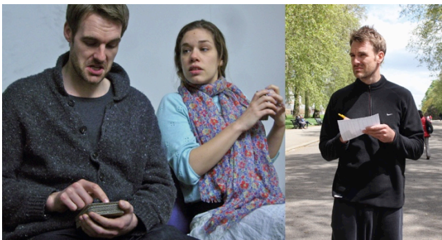
Figure 1: Runner Spotting, with props and in a public park.

The actors predominantly worked in a performance space, however also undertook a pen and paper exercise of ‘Runner Spotting’ in a local park with real runners as a resource for later improvisation. This ‘speculation by improvisation’ [21] ultimately goes beyond the ideation of ‘bodystorming’ [64] or the empathizing of ‘experience prototyping’ [14]. The initial speculation of Runner Spotting became furnished with characters, dialogue, habits and narrative. These sessions were presented (mainly to design audiences) as a short film [20] and Design Fiction [6], with accompanying functional design artifacts.