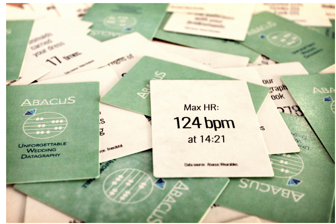
Figure 5: Abacus Data Cards, employed as an interactive catalogue of potential wedding data.

We developed an interactive and playful data catalogue as a set of Abacus Data Cards (Fig. 5). We piloted the structure of the enactment, and these cards in particular, through a set of 12 ‘pre-enactment interviews’ with engaged and married people, as well as wedding industry workers.