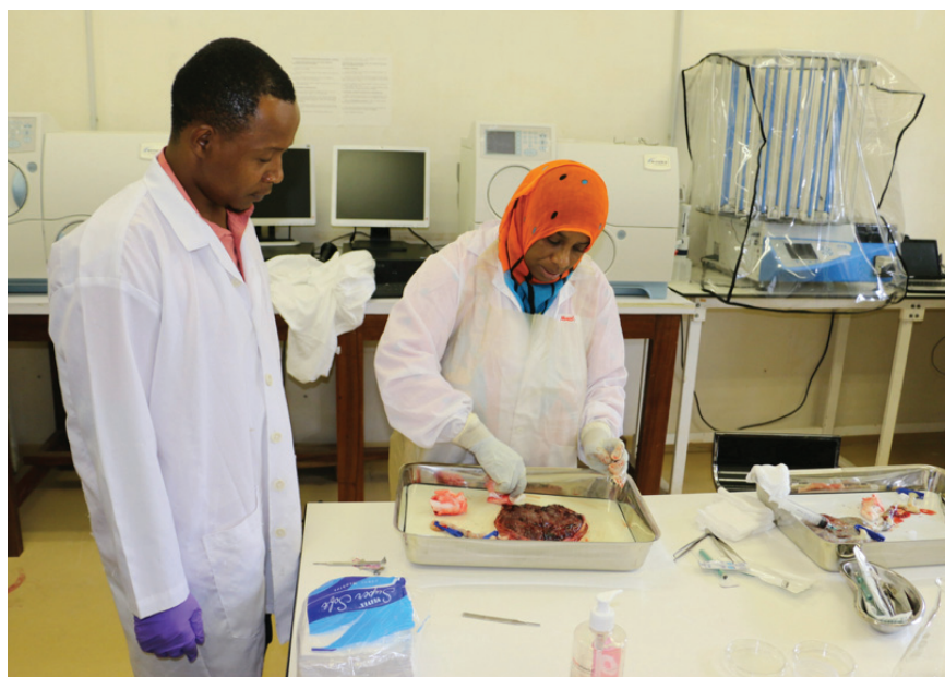
Photo: Researchers in Bangladesh working in their laboratory

Another innovation in this newborn health exercise was the inclusion of