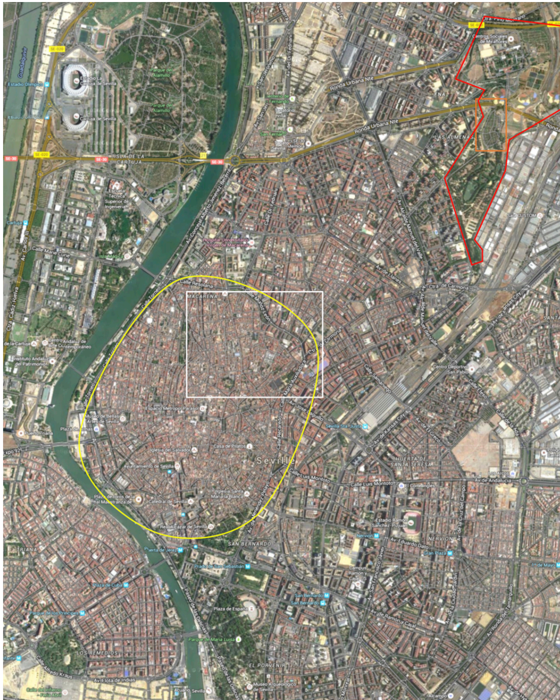
Figure 3. Map of Seville produced by the author using Google Earth, Snagit, Adobe Photoshop, and Microsoft PowerPoint. The yellow line approximately marks Seville's Old Town. The white line approximately marks the area of the Macarena district that extends into the Old Town (inset Figure 4). The red line marks Parque de Miraflores. The orange line approximately identifies Miraflores Sur gardens within Parque de Miraflores.

The two maps, Figures 3 and 4, below show the locations of Miraflores Sur and Huerto del Rey Moro within Seville.