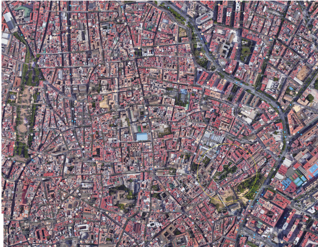
Figure 4. Inset map of Macarena showing location of Huerto del Rey Moro. Image produced by the author using Google Earth, Snagit, Adobe Photoshop, and Microsoft PowerPoint. The yellow circle shows the approximate location of Huerto del Rey Moro. The white line within the circle shows the boundaries of the garden. The large open space to the far left of the image is the Alameda de Hercules. The main road that passes from the top to the bottom of the image marks the historic boundary of the Old Town.

Community narratives in Huerto del Rey Moro and Miraflores Sur are continuously reproduced and reimagined by the gardeners and the local communities. As mentioned above, two narrative threads emerged from my early data analysis – narratives of resistance and narratives of restoration – that reflect and in turn shape how gardeners perceive and experience the garden. In order to draw out these narratives and better understand how they relate to the ongoing use of the gardens as dynamic spaces, I will draw on both the first participatory video process that took place across the two sites in 2016, as well as semi-structured qualitative interviews with gardeners from both sites across 2016-17.