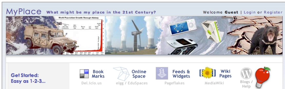
Figure 2 – Entry of the MyPlace Project

Clearly a compelling topic demonstrates a hallmark of the WebQuest, however, in order to accommodate the openness necessary to encourage intrinsic motivation and a culture of thinking, the format presents options within a series of structures. These structures and the associated Web 2 applications are described below.