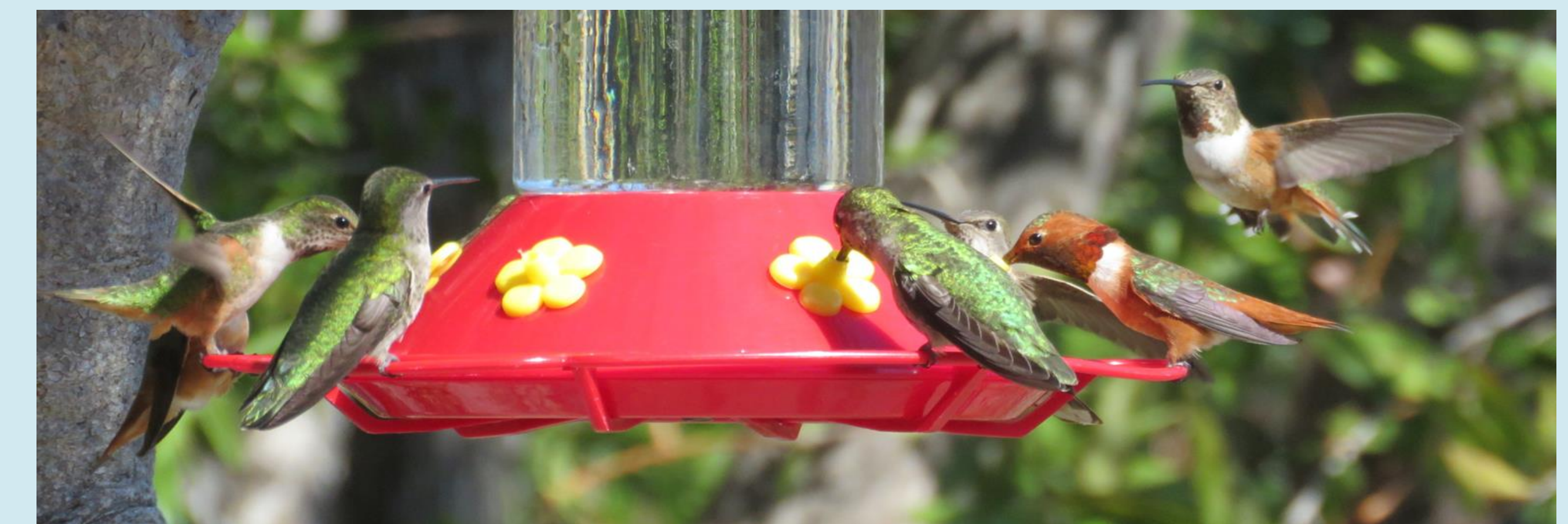
Hummingbird feeder on the Gottlieb property