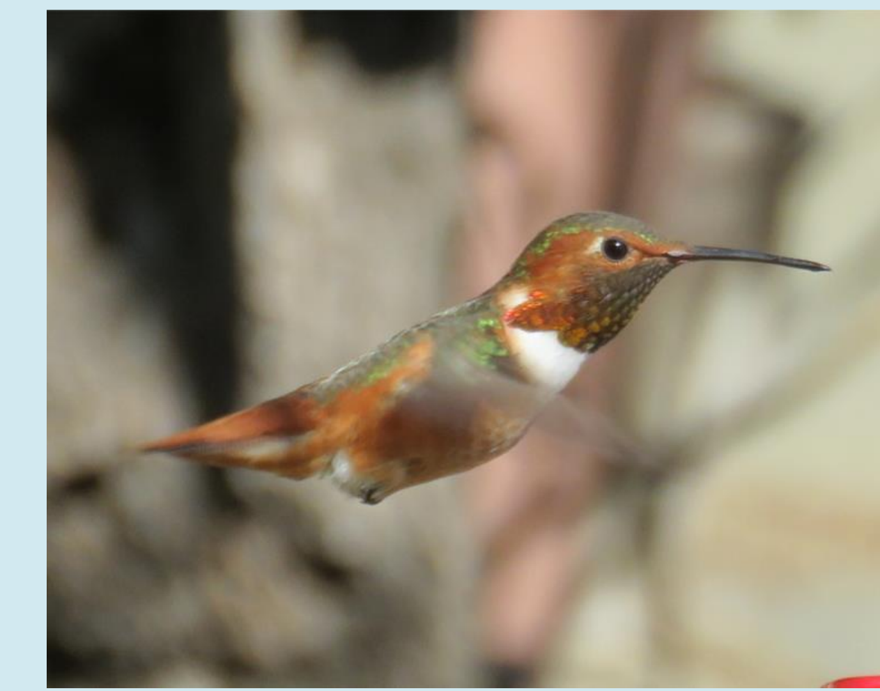
Male Allen's Hummingbird