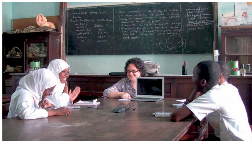
Figure 2. Group interview in an urban school in Zanzibar.

of Mathematics performance. Their performance in the English test using some original items can predict 42 % of the learners' performance in Mathematics test, 65% in Biology and 66 % in Chemistry.