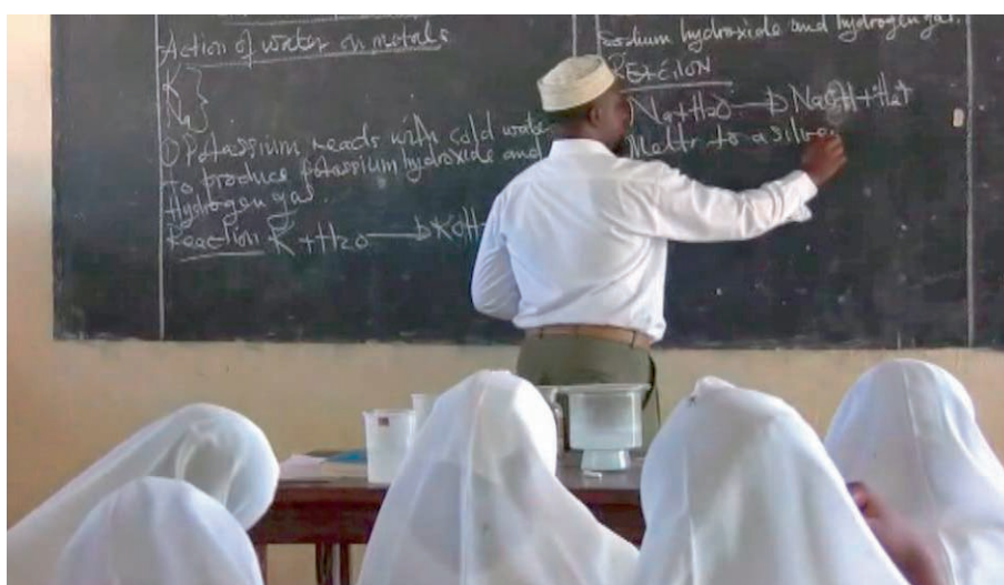
Figure 5. Teacher constructing the chemical equation for the sodium and water experiment.

In this video, the teacher is building up the chemical equation of the reaction whose demonstration was conducted with the help of the girl in video 2 (figure 5). The primary aim of this clip is to forge a context for discussion of the link between experimental evidence and the symbolic representation underlying this evidence.