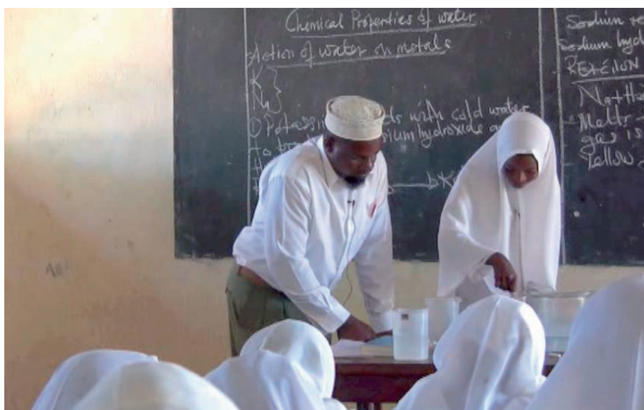
Figure 4. Girl participating in the demonstration activity.

In this video, the teacher invites a girl to come to the front of the classroom to drop a piece of sodium into water as part of his demonstration on teaching about the reaction of acids with metals (figure 4). The mode of teaching that dominates Zanzibar school is the transmission model where there is little participation by the pupils in classroom talk and activities more widely. There is also considerable issue with the inclusion of girls in science given gender inequity persists across much of the sub-Saharan African region. In this respect, the clip was intended to promote an image of gender diversity and inclusion in science.