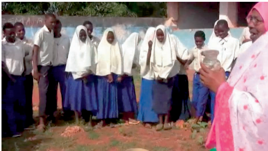
Figure 3. Demonstration out of the classroom in the school yard.

In this video, the teacher takes the class into the school garden in order to demonstrate how sodium reacts with water (figure 3). The children get into a big circle and the teacher uses a bucket to throw a big chunk of the metal into water. This video was intended to stimulate the children's discussion about the context of science learning.