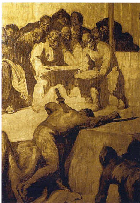
SERT. MURAL IN TOWN HALL OF BARCELONA (DETAIL).

The work of the deputies on this commission materialized in the two resolutions by the Catalan Parliament: one (7 February 1990) guaranteeing confiden-