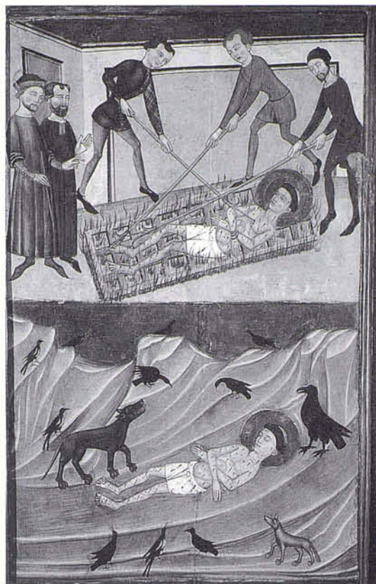
MARTYRDOM AND DEATH OF SAINT VINCENT, XIVth C.

Olimpiada Cultural constitutes a unique experience. Its work must therefore be taken advantage of by all the cities that organise Olympic Games in the future and are conscious of the meaning of the Olympic spirit.