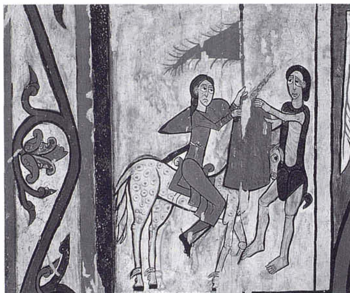
MUSEU EPISCOPAL DE VIC