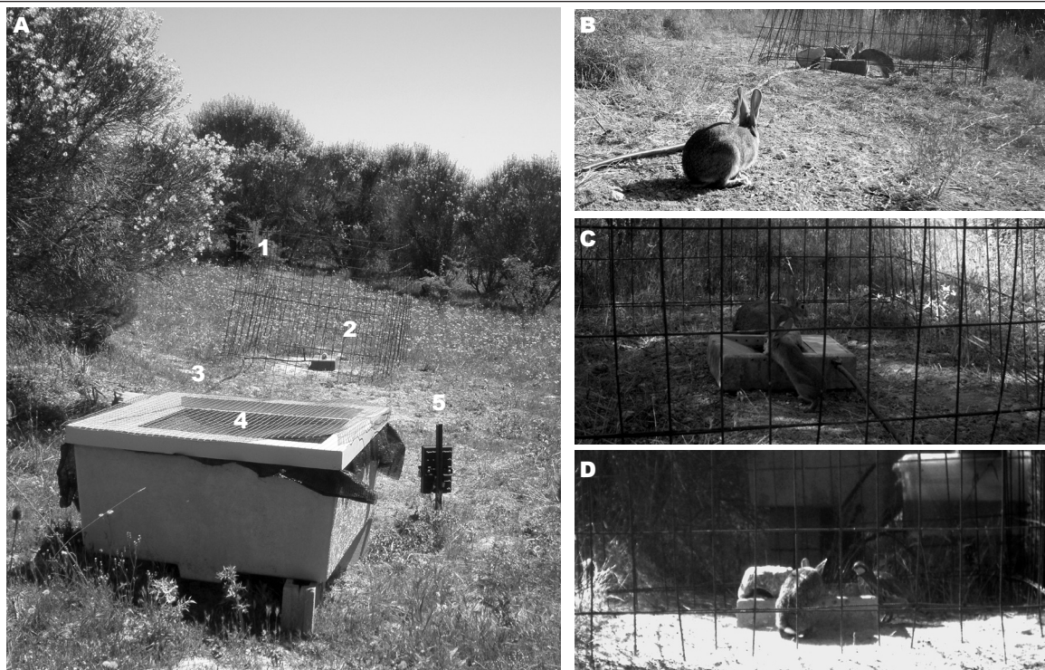
Fig. 1. A. Example of a 'protected' water trough: 1. Metal fence; 2. Trough; 3. Plastic pipe; 4. Water tank; and 5. Camera trap. B. Images of three rabbits drinking at the same time; C. Two drinking rabbits (possibly one juvenile); and D. A rabbit and a red-legged partridge.

Fig. 1. A. Ejemplo de un bebedero con cobertura vegetal: 1. Valla metálica; 2. Bebedero propiamente dicho; 3. Tubería plástica; 4. Depósito de agua; 5. Cámara de fototrampeo. B. Imágenes de tres conejos bebiendo al mismo tiempo; C. Dos conejos bebiendo (posiblemente uno de ellos juvenil); D. Un conejo y una perdiz roja.