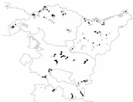
Fig. 1. Sample units (○) and detected territories of little owl (●) in the Basque Country in the breeding season of 2009.

Fig. 1. Unidades de muestreo (○) y territorios de mochuelo detectados (●) en el País Vasco durante el periodo reproductor de 2009.