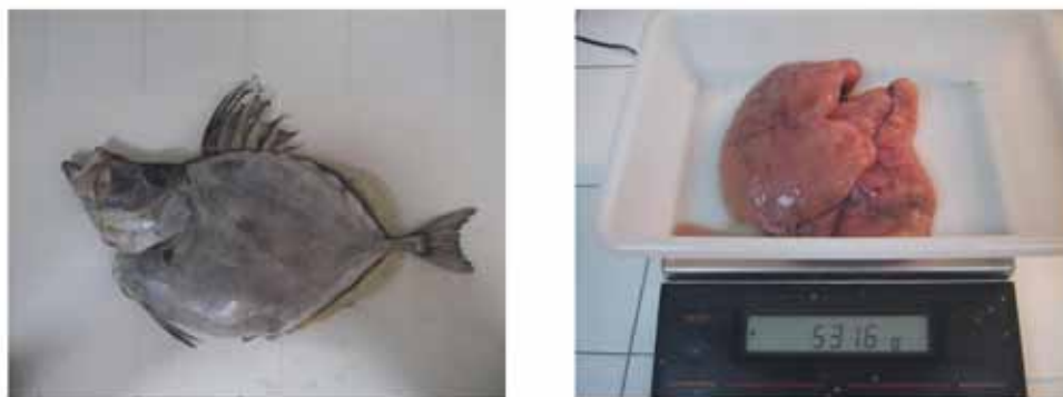
Fig. 2. Zenopsis conchifer IIPB 68/2007 (605 mm TL) and the specimen gonads. Fig. 2. Zenopsis conchifer IIPB 68/2007 (605 mm TL) y sus gónadas.