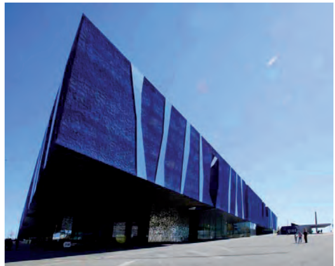
Fig. 3. The Museu Blau building.

They were also deeply involved in the museography and thus took care to integrate the scientific content of the exhibits with the already existing spaces. In fact, the exhibition arrangement follows the logic of the existing space and at the same time completely alters it. Interior patios, which might have been considered a hindrance, now seem to have been especially designed for the Museum. One of the two main exhibits and the one that visitors first encounter is the history and evolution of the Earth and life on our planet. The specimens are displayed such that they seem to emerge from the dark surfaces of the