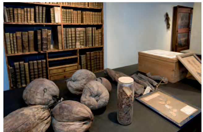
Fig. 1. Library and cabinet of the Salvador's, reproduced at the Botanical Institute of Barcelona.

In 2007, representatives of 93 natural history institutions (including museums, research institutes, botanical gardens, and zoos) from 36 countries around the world signed “The Buffon Declaration: Natural History Institutions and the Environmental Crisis.” [4] The Declaration states that science is crucial for the sustainable management of biodiversity and ecosystems and, therefore, for the survival of human life on the planet. In this context, natural history institutions make four vital contributions: (i) they are the primary repositories of the scientific samples on which our understanding of the variety of life is ultimately based, (ii) through cutting-edge research, they expand our knowledge of the structure and dynamics of biodiversity in the present and the past, (iii) through partnerships, training, and capacity-building programs, they improve the world's ability to address current and future environmental challenges, and (iv) they provide a forum for direct engagement with society, which is essential to help bring about the behavioral changes on which our common future and the future of nature depend. The signatories affirmed the role of natural history institutions in serving the collective good and in linking science, policymakers, and civil society [2].