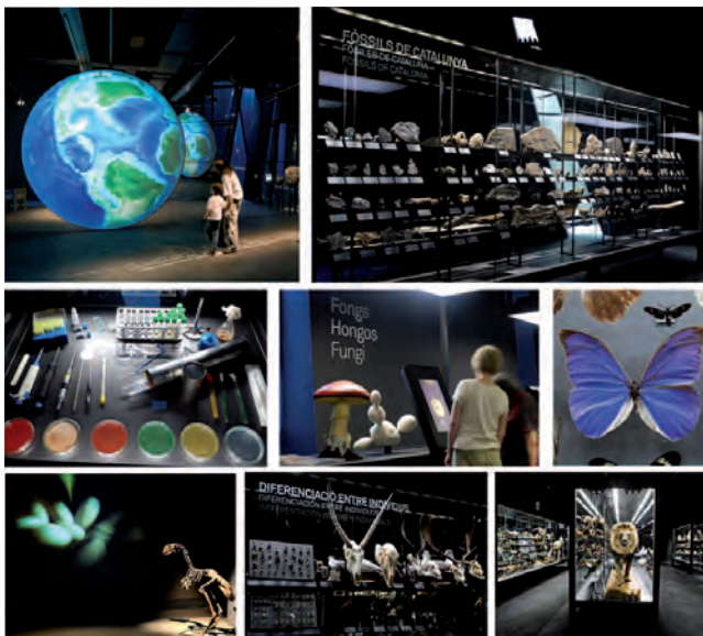
Fig. 5. In 'Planet Life' visitors discover a fascinating, diverse world of fossils, animals, plants, algae, fungi, microbes, rocks, and minerals. The exhibition occupies the largest area on the main floor.

The Earth Today. In this 1700-m 2 exhibit area, visitors discover a diverse world of fossils, animal, fungi, plants, algae, microbes, rocks and minerals. Some sections are based on the Museum's historical collections; in fact, more than 5000 such items are on display. In addition, new collections of taxonomic groups not represented in the former Museum, including fungi, algae, and microorganisms, have been prepared for this exhibit. In the case of microorganisms, the inclusion of fixed cultures was quite labor-intensive, because they are not usually contained in natural history museum collections. This is a puzzling absence, since microorganisms are not only the most abundant living beings on Earth, they are a life form essential to maintaining further life on the planet.