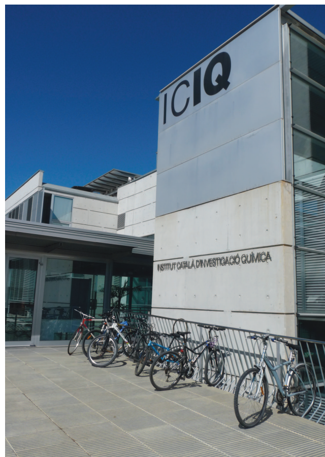
Fig.1. Entrance to the Institute of Chemical Research of Catalonia (ICIQ) facilities.

In terms of research output, between March 2004 and May 2010, the ICIQ published more than 600 scientific papers, reaching an h-index of 50. Additionally, a total of 24 patent applications were filed.