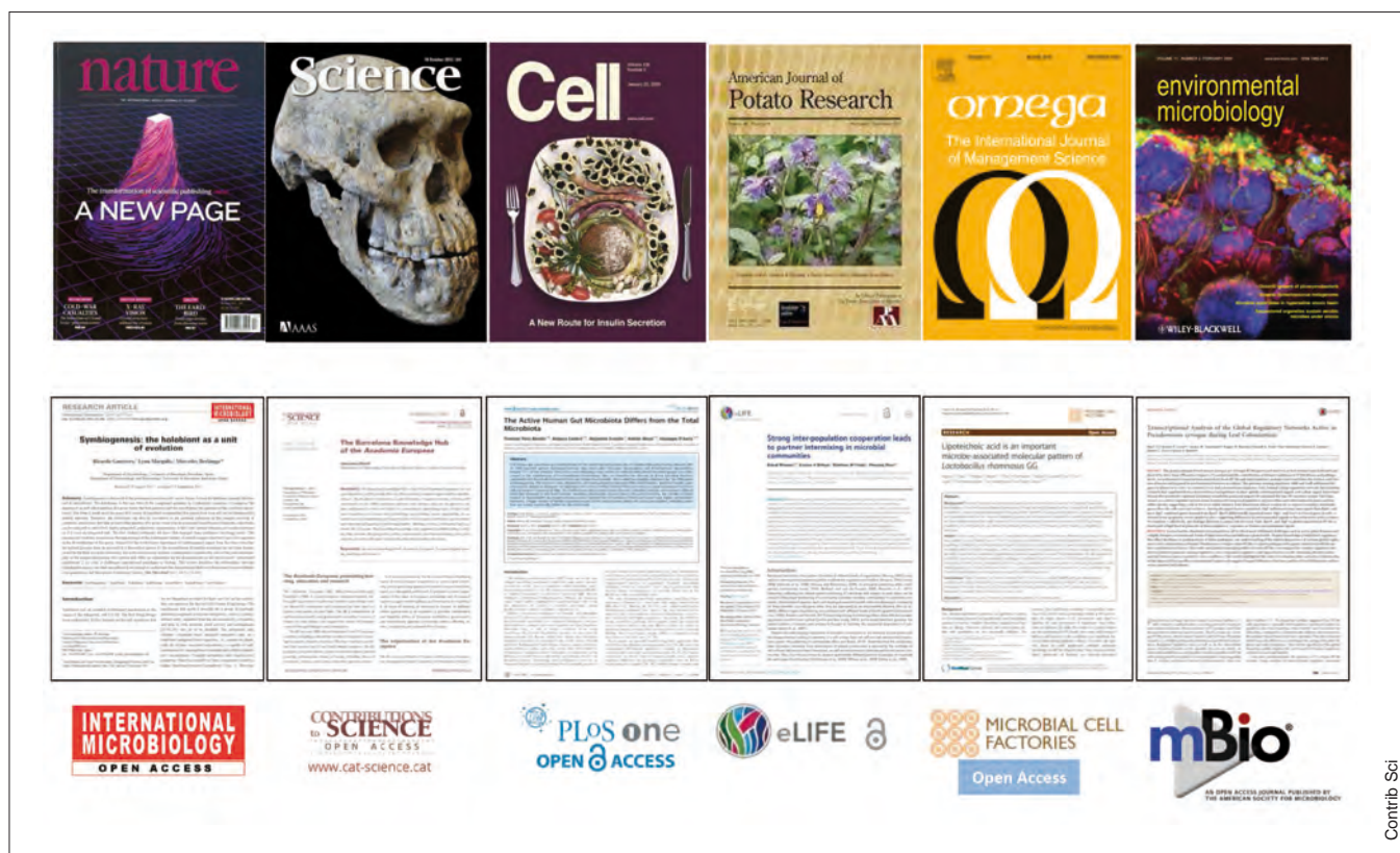
Fig. 2. Covers of different publications: subscription journals (upper row), and open-access-only journals (lower row).

vate foundation has agreed to fund experiments to replicate fifty high-impact papers in cancer biology published between 2010 and 2012, and the work will be carried out independently by a network of expert labs (to learn more, visit The Reproducibility Project: Cancer Biology [ https://osf.io/e81xl/wiki/home/ ]). We have agreed to handle this and eventually publish the reproducibility studies in eLife , so we will know, at least for these fifty papers, how many of them are really reproducible. We are just getting started with this, so it may be a couple of years, but it's what we'd like to do.