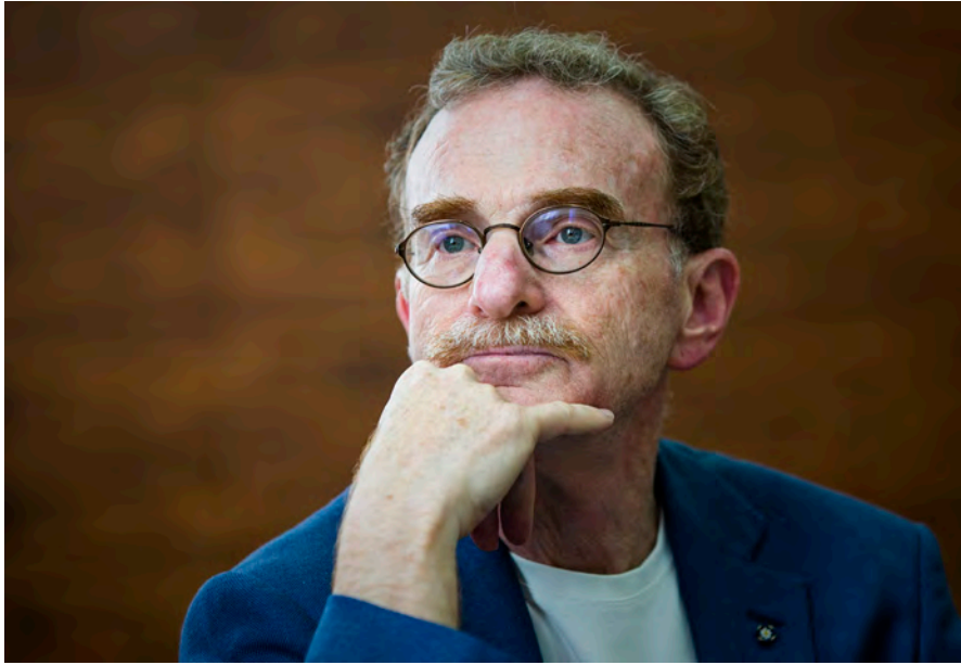
Fig. 1. Randy W. Schekman, 2013 Nobel Prize in Physiology or Medicine.

Because nearly all of the vesicle traffic steps are encoded by highly-conserved genes, Schekman and colleagues' pioneering work led to the development of tools to study other types of cells. It turned out that some of the genes Schekman had discovered in yeast were also present in mammals, encoding the corresponding proteins and thus "revealing an ancient evolutionary origin of the transport system" [3,11]. As a result, according to the committee of the Dickson Prize in Medicine, an award he received in 2008, "it is nearly impossible to attend a large meeting in cell biology, biochemistry, genetics or molecular biology and not hear someone mention a homolog of one of the genes discovered by the Schekman lab" [3].