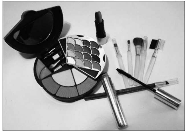
Figure 2. Cosmetic Magic Colors. Lead-based chemistry, which was initiated in Egypt more than 4000 years ago, could result in the synthesis of lead sulfide nanocrystals by the judicious combination of naturally available minerals with oils. With a diameter of about 5 nm, the appearance of these crystals is quite similar to PbS quantum dots synthesized by modern materials science techniques (the picture does not correspond to the cited materials).

delivery process, but a very important problem in terms of the nanoparticles being accumulated in cells or circulate in plasma, as individual particles or agglomerates.