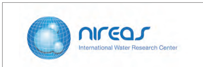
Fig. 1. Logo of the International Water Research Center (Nireas).

The creation of the Center, in January 2011, is the culmination of research efforts and a successful research proposal by the Center's Board of Directors. The Center is currently co-financed by the European Regional Development Fund and the Republic of Cyprus through the Research Promotion Foundation and the University of Cyprus. It is named after Nireas (Nereus), one of the most important water deities of Greek mythology, known for his truthfulness and virtue, and most often referred to as the "old man of the sea" (Fig. 2). In the Greek language, the word "Nireas" connotes flowing water.