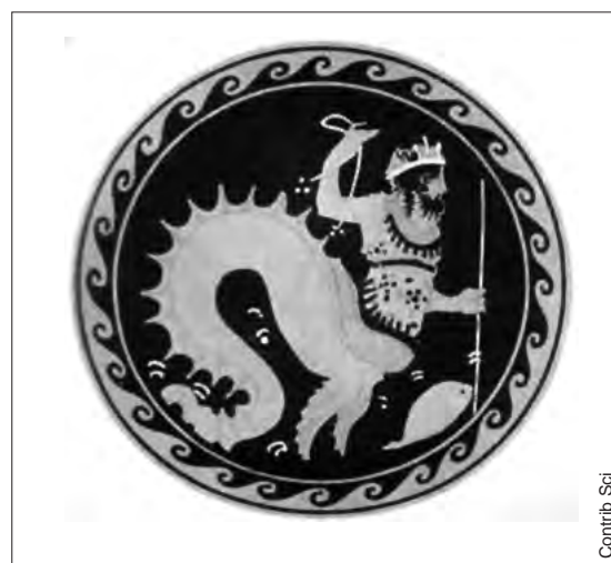
Fig. 2. Nireas or Nereus in ancient Greek mythology.

Of course, the aforementioned measures are a relatively common practice for many arid-weather Mediterranean and southern European countries, which have over the years been faced with extended periods of drought and short supplies of water. However, the case of Cyprus is of particular interest: Cyprus currently has the largest number of dams per square kilometer in Europe and the largest storage volume per capita, with over 100 dams and a total capacity of 304 million m 3 . Yet in 2008, after 4 years of drought and increasing water consumption, the Republic of Cyprus was forced to take drastic measures to safeguard diminishing national water reserves and to prepare for worsening drought conditions. These measures included the importation of water by ships from neighboring Greece, the enforcement of an intermittent water supply policy (city residents were provided with water through city water pipelines for about 12 h every 48 h) and the construction of several desalination plants. The intermittent water supply lasted for about 2 years (March 2008–October 2010) and put the country's water reserves (volume and quality), its residents, and its economy under enormous strain.