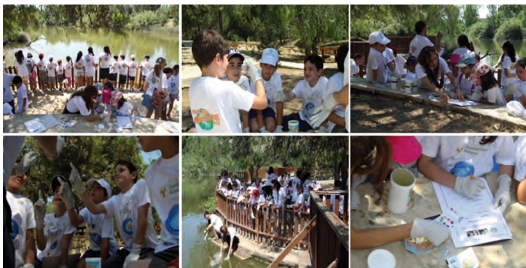
Fig. 4. World Water Monitoring Day in Cyprus.

assessment of multi-component chemical mixtures to humans and the ecosystem (TOMIXX, PENEK/0609/24, 2010–2012).