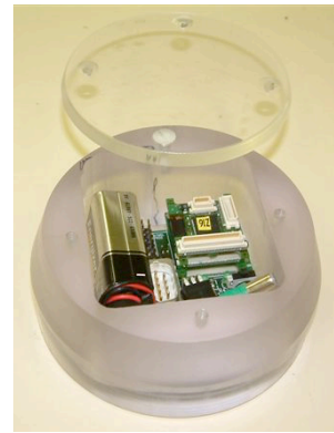
Figure 3. Car Parking Node in Enclosure

The power layer was replaced by a set of two AA batteries (or alternatively a 9v battery as shown in Fig 3) as sensor node lifetime is considered more important than node size. The resulting system is encased in a 15cm x 15cm plastic box that can be glued to the ground.