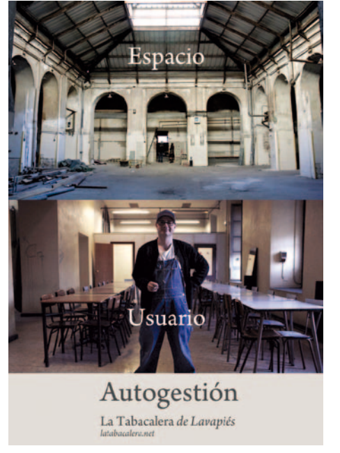
▲ Tabacalera, Madrid, 2010