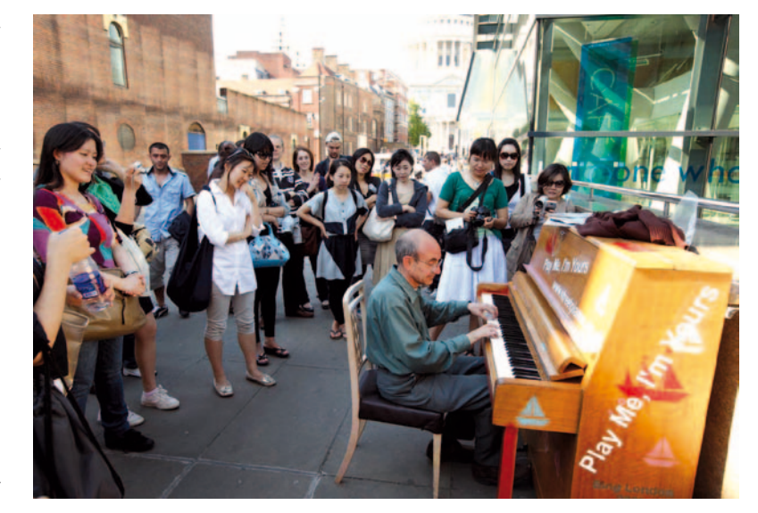
▲ Luke Jerram. Play Me, I'm Yours., 2008

Bristol Food for Free is a Web-based database that provides information on edible plants in the city of Bristol. The webpage generates maps for all of the 113 species identified and also shows new potential planting sites, allowing novice gatherers to find fresh fruits and vegetables quickly and safely.