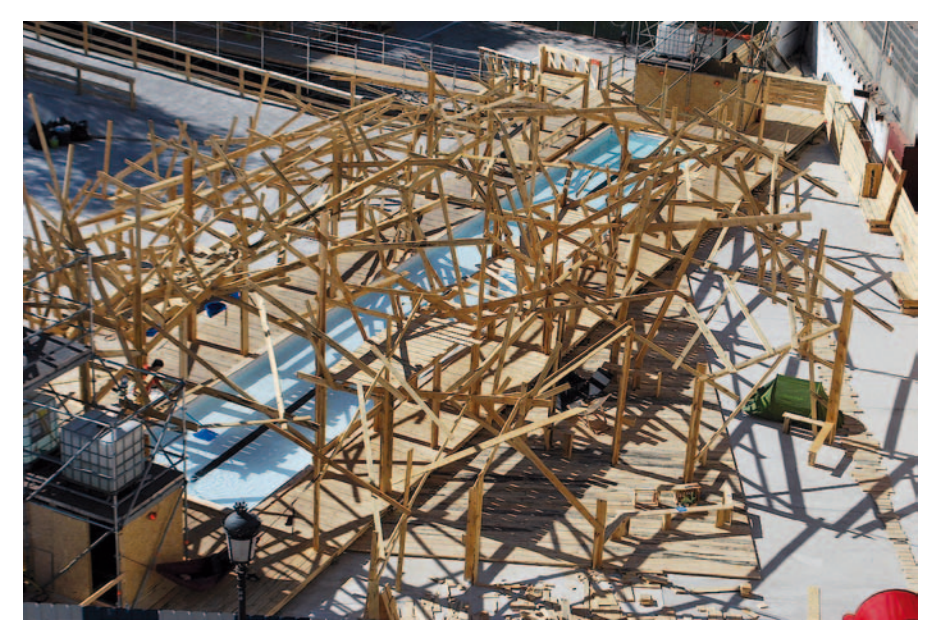
▲ eXYZt. Isla Ciudad (City IsLand), 2010