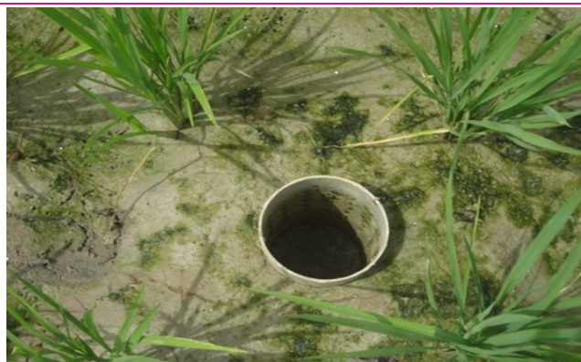
Fig. 1. Perforated PVC pipe to measure depletion of water.

When the water level in the pipe fell into 10, 15 and 20 cm from the pipe's top surface, the next irrigation was given till the standing flooded water of 5 cm. The quantity of irrigation was measured by Parshall flume for every plot, whenever the field was irrigated. This process was continued till one week before the harvest stage, except one week before and after of flowering stage (In the flowering stage, it has been maintained