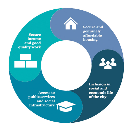
Figure 1. Secure Livelihoods Infrastructure. IGP 2021.

Approaching livelihood security in infrastructural terms foregrounds these interactions. It offers decision-makers a framework to examine the contextspecific ways that different assets interact with each other, and intersect with inequalities linked to class, race, gender, and other identities. This provides a nuanced understanding of how the links between services, networks, and resources that support livelihood security are configured for particular groups at specific points in time. This draws attention to where a lack of access in one infrastructural component can undermine the strength of others to create insecurity and instability. As in the case of east London, where insecure and poor quality work, low wages, unaffordable housing, and diminishing public services generate a spiral of negative interactions. What we see is that local communities carry the burden, where by social networks of friends, family and neighbours, informally provide essential support, such as childcare, as people live with insecurity (Woodcraft and Anderson, 2019).