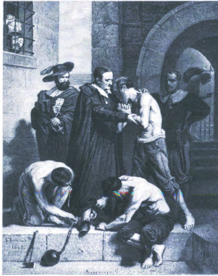
Saint Vincent de Paul Prend Les Fers d'un Galérier.

Tableau de M. Bonnat dans l'église Saint-Nicolas-des-Champs, Paris.