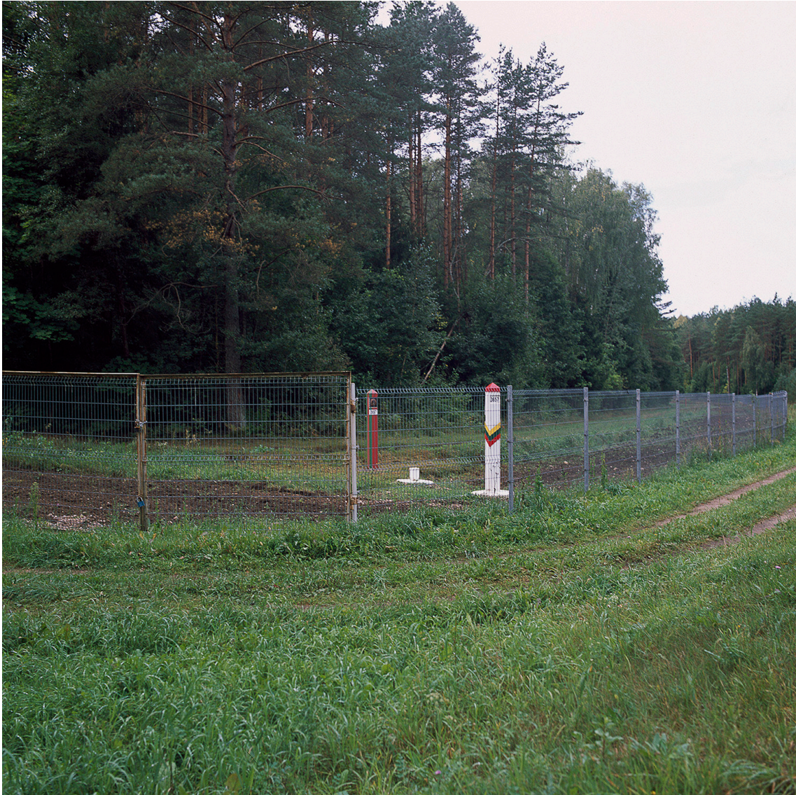
Figure 11. Border fence, Lithuania-Belarus border.