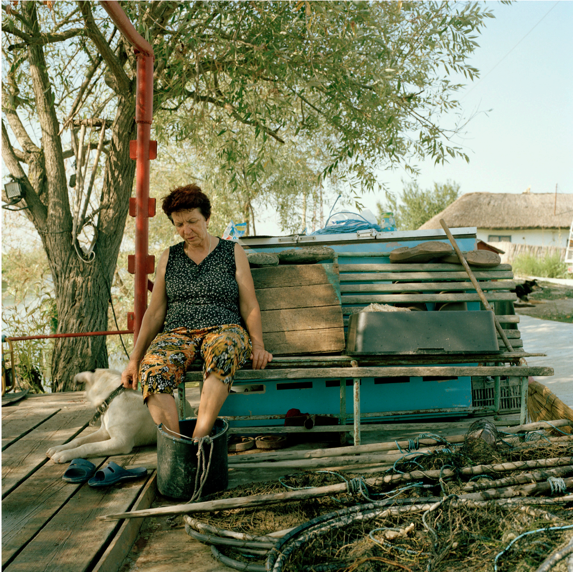
Figure 15. Lipovan lady, Border Romania-Ukraine.