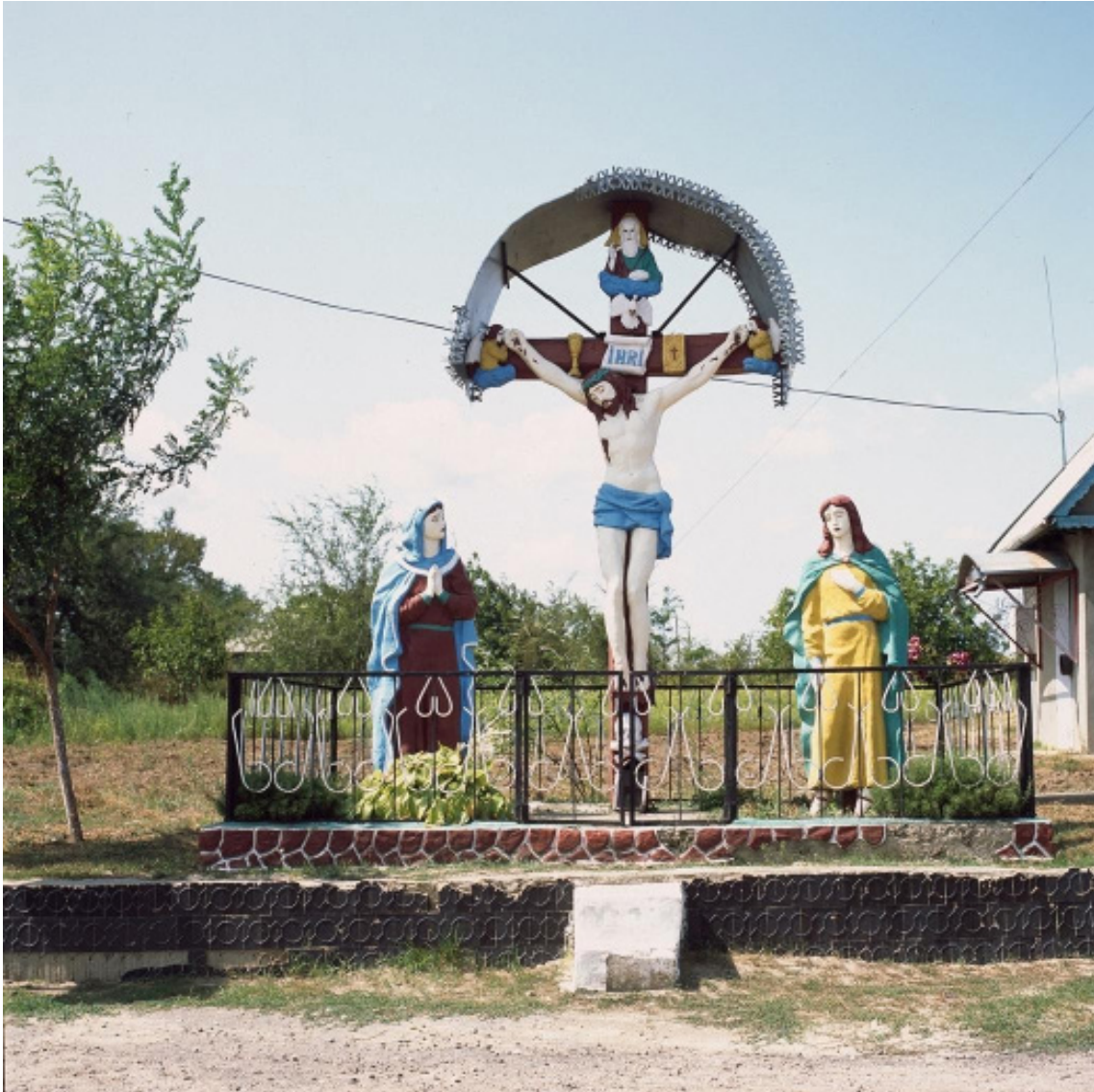
Figure 3. Crucifixion, Border Moldova-Romania.