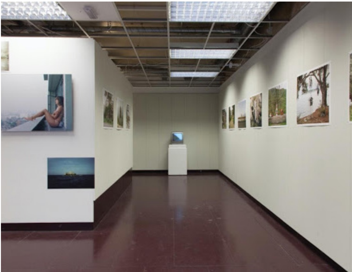
Figure 18-20. Territorial exhibition at The Cass Bank Space Gallery, 2016.