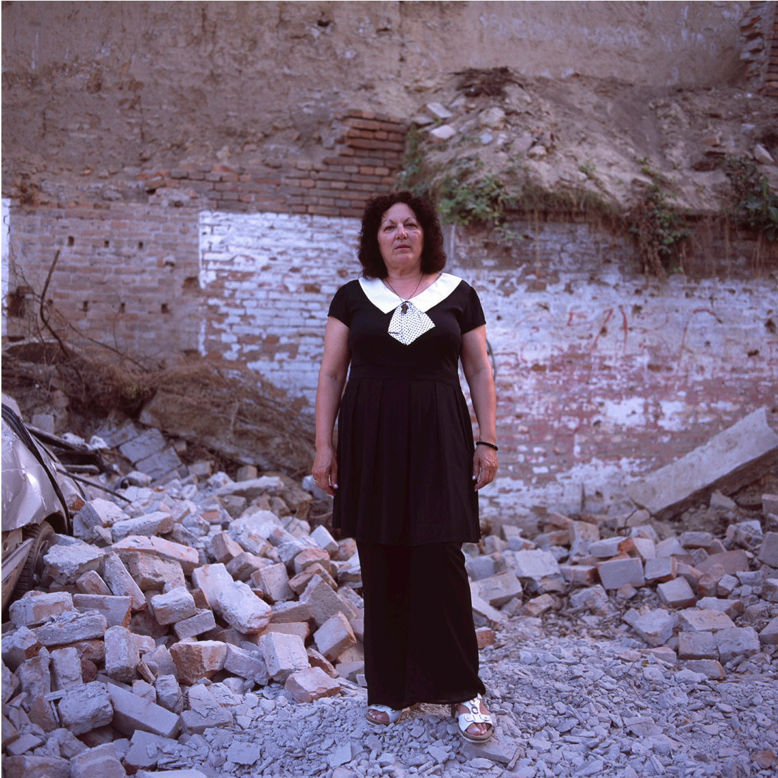
Figure 16. Zara, Border Croatia-Serbia.