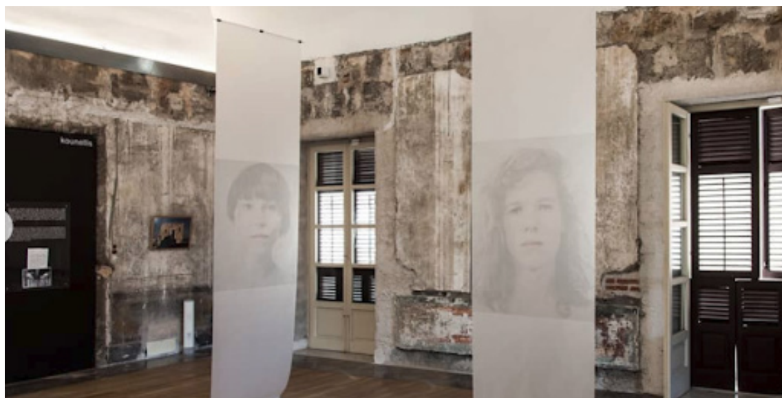
Figure 16-17. Shifting Stances exhibition at Museo Palazzo Riso, 2019.