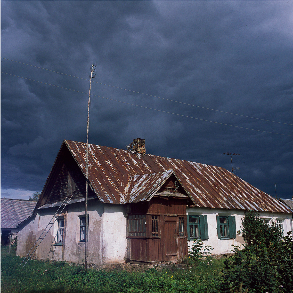
Figure 14. Before the storm, border Lithuania-Belarus.