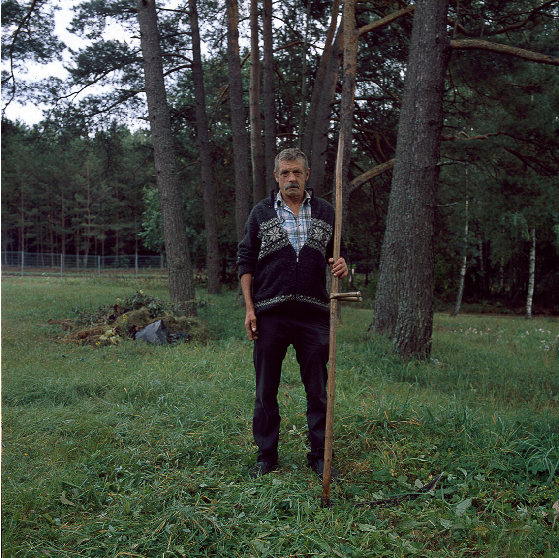
Figure 13. Day Labourer, Border Lithuania-Belarus.