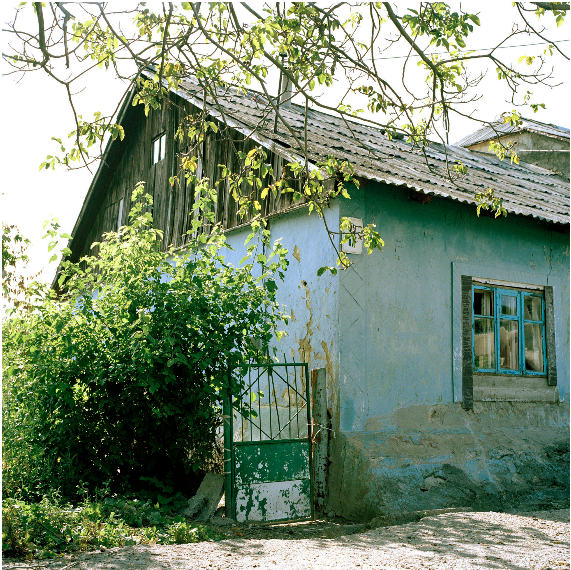
Figure 5. Abandoned house, Border Moldova-Romania.