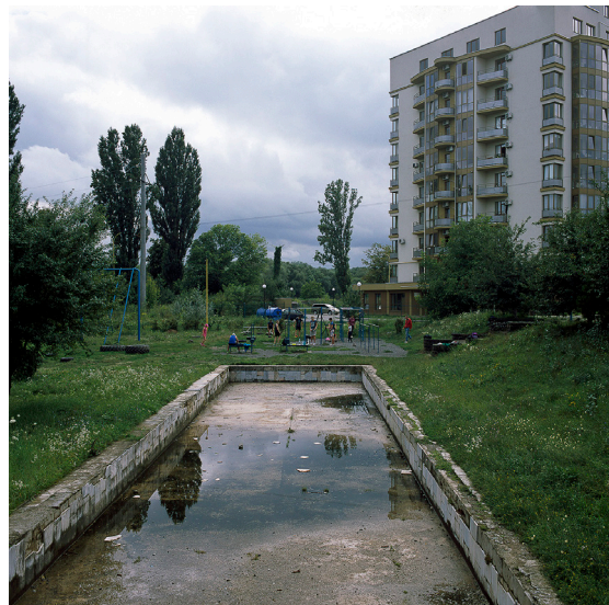
Figure 23-26. Excerpts from the series.