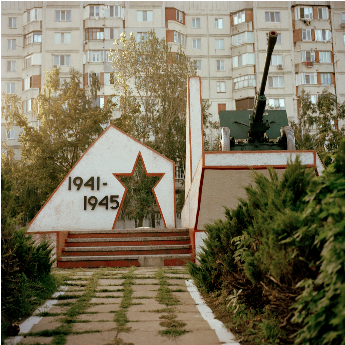
Figure 2. War Memorial, Border Moldova-Romania