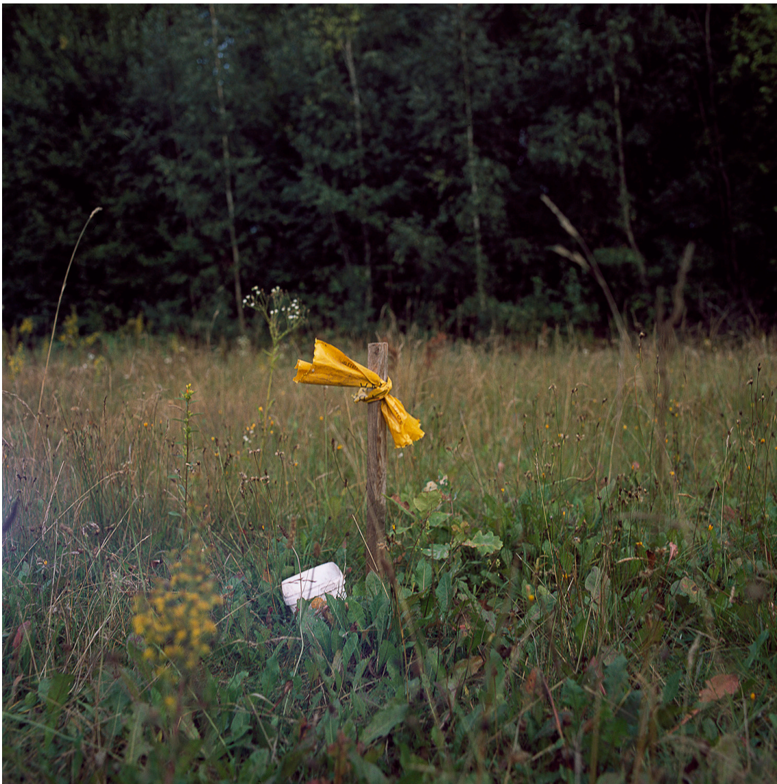
Figure 12. Border marker, Border Lithuania-Belarus.