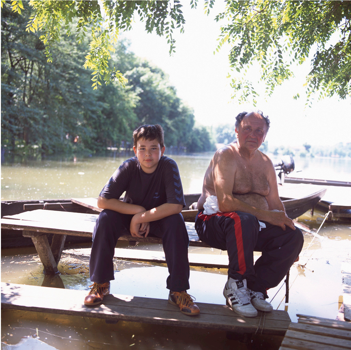
Figure 9. Danube Overflown (Grandad and grandson), Border Croatia-Serbia.