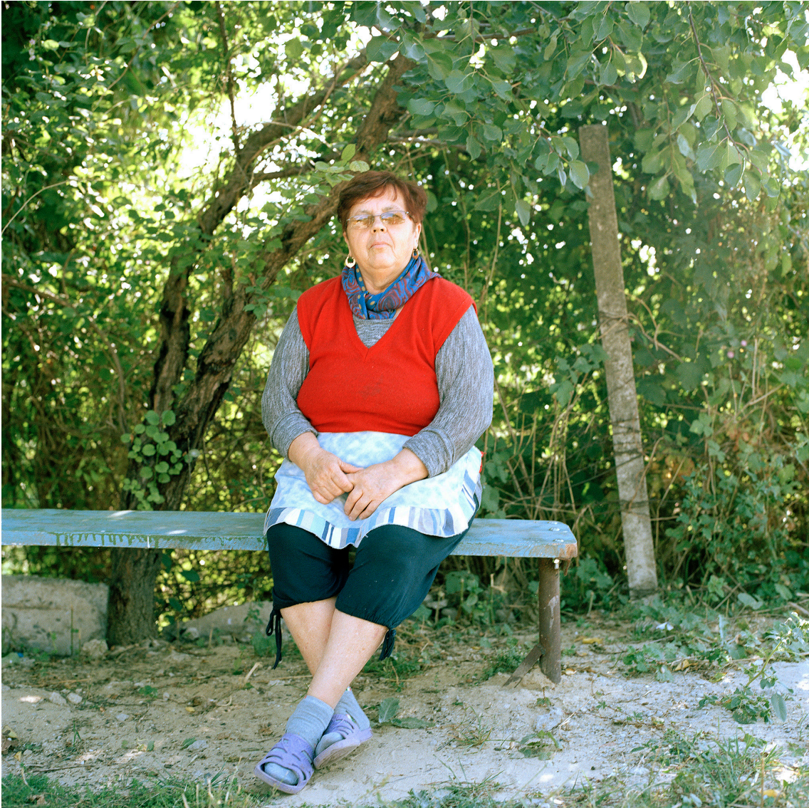
Figure 4. Lubjia, Border Moldova-Romania.