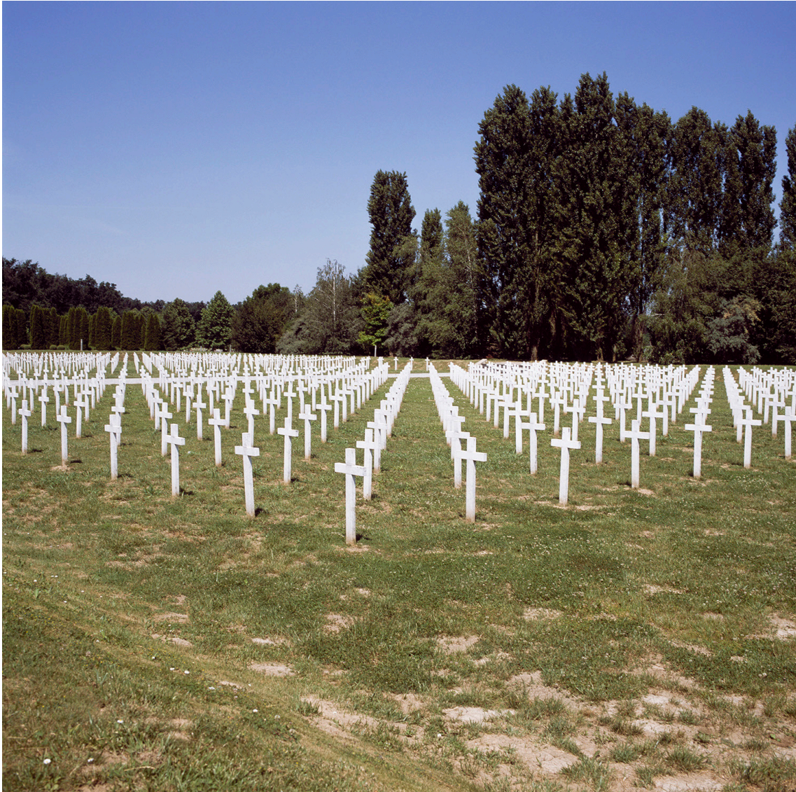
Figure 6. Balkan War cemetery, Border Croatia-Serbia.