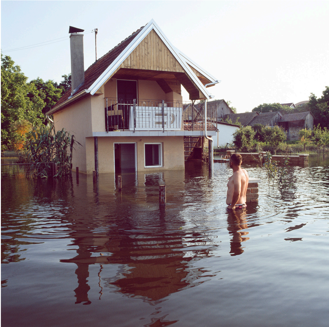
Figure 7. Danube Overflow, Border Croatia-Serbia.