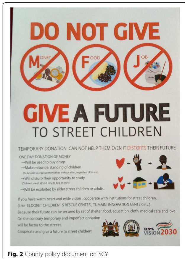
Fig. 2 County policy document on SCY

professionally trained teachers, but if you do something nasty, they will remind you that you were a street child. (Stakeholder)