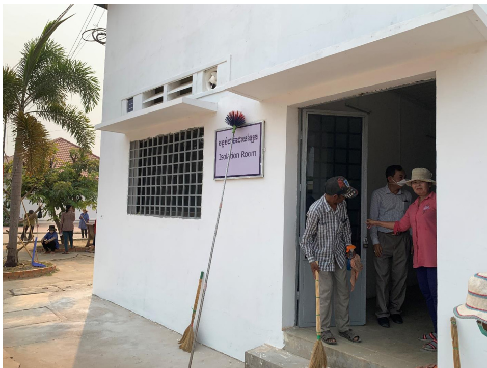
Photo 1. Preparing isolation ward at a provincial hospital in Cambodia, Credit: Shahul Ebrahim.

The peacekeeping missions of the United Nations ( World Health Organization, 2016 ) and the African Union are examples of international stewardship for security. Such options must be explored for mitigation efforts where needed. For example, if a