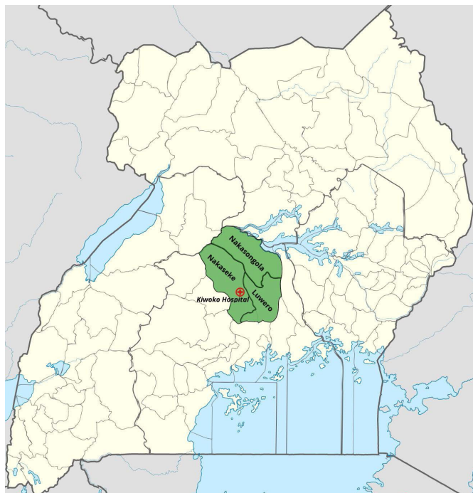
Figure 2 Map showing Hospital to Home study districts.