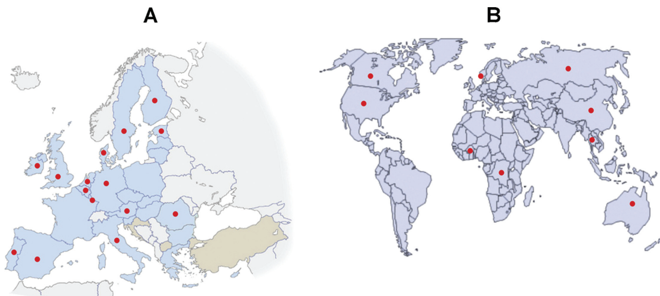
Figure 1. Distribution of GP-TCM members within and beyond the EU. (A) Fifteen EU member states were involved in GP-TCM. They were Austria, Belgium, Denmark, Estonia, Finland, Germany, Ireland, Italy, Luxembourg, the Netherlands, Portugal, Romania, Spain, Sweden and the UK, as highlighted by red dots. (B) Nine non-EU countries were involved in GP-TCM, including Australia, Burkina Faso, Canada, China, D.R. Congo, Norway, Russia, Thailand and the USA, also highlighted by red dots. [Ref: 38].

good for the quality control of such medicines, but also useful for the discovery of new indications or the development of new formulations. In addition to GMP conditions applied during production, good quality control analyses should include both chemical fingerprints and biological fingerprints of botanicals.