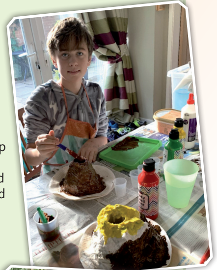
Making a model volcano

● Volcano. Bicarbonate of soda, red food dye and vinegar are mixed and added to a plastic bottle in a volcano model.