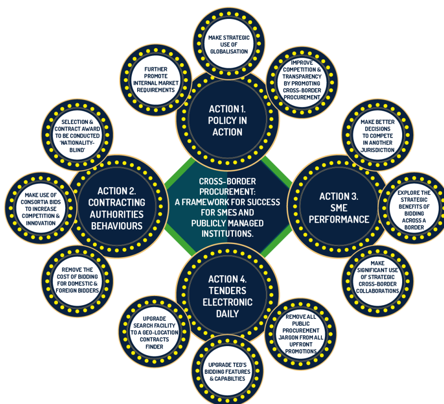
Diagram 2: A Pictorial Illustration of Our New Framework Cross-Border Procurement-A Framework for Success for SMEs and Publicly Managed Institutions

Cross-Border Performance; and Action 4: TED-Plus- Transparency, Intuition and the Removal of Home Bias.