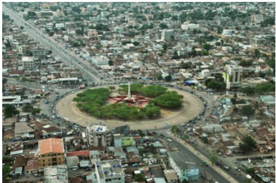
Figure 2. The main roundabout.

was more than one person in the office, we interviewed the oldest one. It allowed us to associate at each respondent a unique GPS coordinates of his workplace. We counted a total of 203 shops in the study site. In 194 of these shops, people accepted to participate in the study so we interviewed 194 individuals.