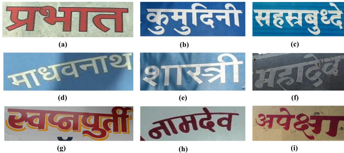
Figure 1. Various challenges in Devanagari scene text recognition (a) Simple text with rough background (b) Text with modifiers (c) Text with conjunct (d) Uneven illumination (e) Shadow effect (f) Poor quality text (g) Artistic text (h) Curved text (i) Perspective distortion.

segmentation (separation) is the first step in the scene text recognition process. It becomes critical due to complex background, uneven lighting, shadow effects, climatic conditions etc. Some challenges in scene text recognition along with some challenges specific to the Devanagari script, are shown in Fig. 1.