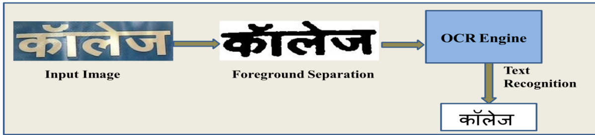
Figure 2. The flow of proposed work