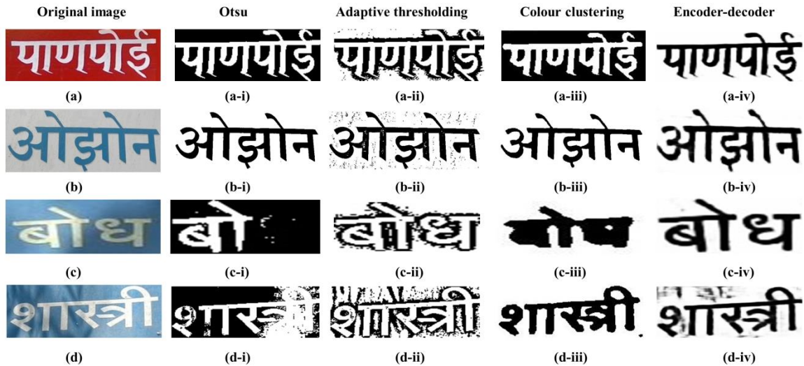
Figure 5. Comparison of outputs from different pre-processing methods for different images (a) image with light text on dark background (b) image with dark text on a light background (c) uneven illumination (d) shadow effect; (i) corresponding binary image (Otsu) (ii) segmentation with adaptive thresholding (iii) segmentation by colour clustering (iv) segmentation by the encoder-decoder method