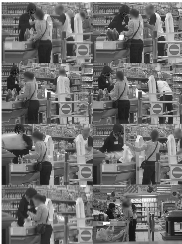
Figure 3. The author checking out.