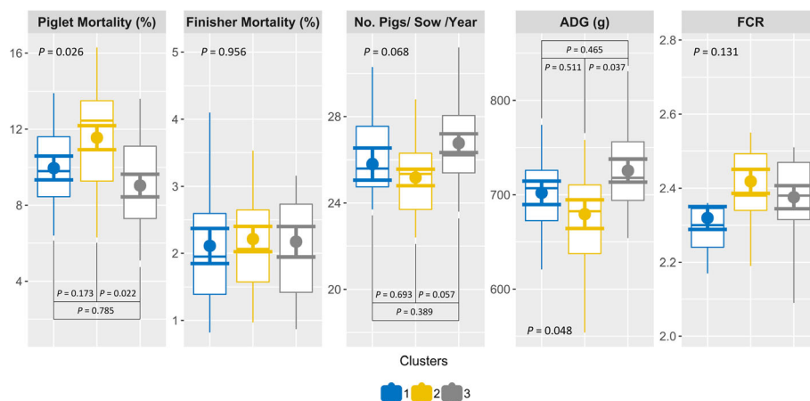
Fig. 2 Boxplots of productive performance indicators (with mean \pm SD) across farm clusters of farms grouped according to their biosecurity scores in external and internal biosecurity categories. Legend: ADG (g/day) – Average daily gain, FCR – Feed conversion ratio. The clusters represent farms with similar biosecurity scores in external and internal categories. Cluster 1 groups farms with low internal biosecurity and high external biosecurity, cluster 2 groups farms with average external and internal biosecurity, and cluster 3 groups farms with high external and internal biosecurity scores. The productive performance of the farms in each cluster is presented above. ANOVA tests followed by Tukey's correction were used to test differences in productive performance across those clusters

The multivariable model for pig mortality explained only 8% of the variability. The age of the buildings was directly related to mortality. Although 79% of the farms had built new housing for pigs within the previous 5 years, several farms had their latest renovation 10 or 15 years ago. Piglet mortality was also associated to poor biosecurity on feed, water, and equipment supply. As shown in the case of porcine epidemic diarrhoea, these supplies increase the risk of introduction of new diseases, which can be linked to higher mortality. Surprisingly, the farrowing unit management was not