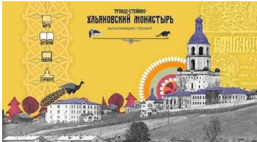
Figure 2 - Screensaver of a multimedia interactive book "Ulyanovsk Convent"

In the “history” section, as well as the photo collage format, 32 objects were indicated, 13 of which were interactive. Active objects were indicated by a conventional sign, so that when the user clicks on it, the object increases in size, and a brief historical background appears (Fig. 3).