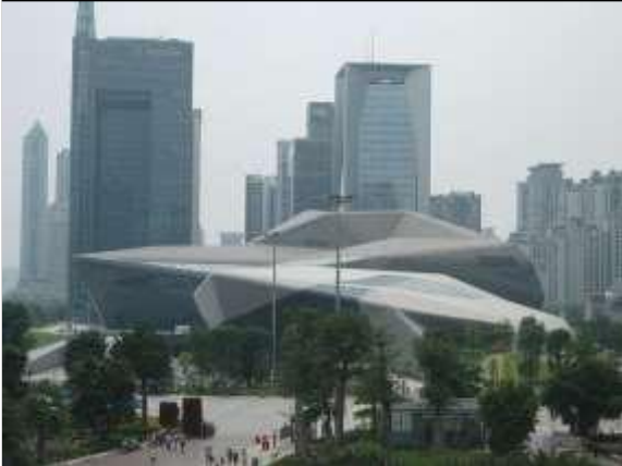
Guangzhou Opera House