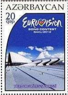
Figure 4. An 2012 Azerbaijani stamp with an image of the Heydar Aliyev Cultural Center (URL12, 2019)

sightseeing tours. It has been a building in front of which everyone visiting Baku wants to take a photograph. It is frequently addressed in the literature of architecture and used as an effective element in the promotion of the city on a national and international scale (Figure 4). Consequently, although the region where it was built was not very popular, it has become famous and increased the brand value of the city.