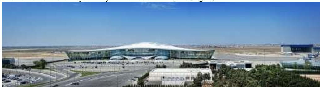
Heydar Aliyev International Airport

Iconic buildings were built to create landmarks, to develop an urban brand and to improve the recognition of the city. Some of the recently constructed icon buildings for the modern urban image are the Flag Tower, the Crystal Hall, the Flame Towers and the Heydar Aliyev International Airport (Fig. 1).