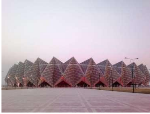
the Crystal Hall