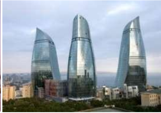
the Flame Towers