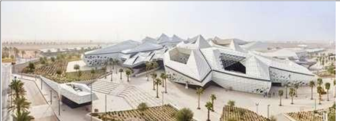
King Abdullah Petroleum Studies and Research Centre