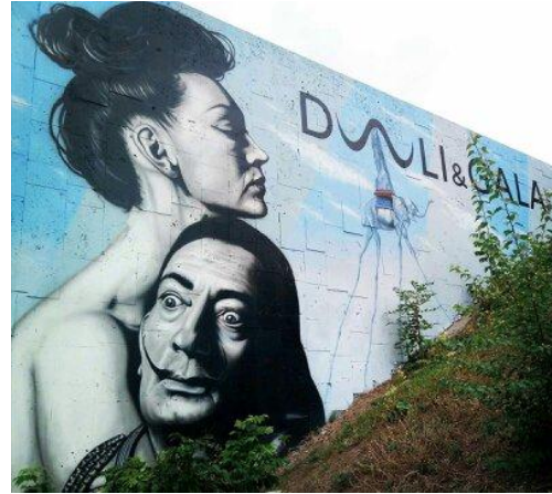
Fig. 5 – Graffiti Salvador Dali, Kharkiv