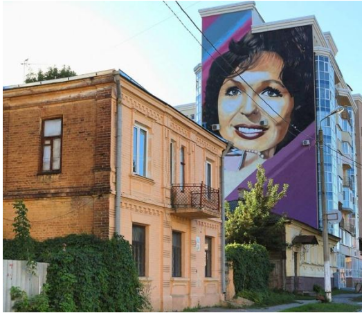
Fig. 4 – Portrait of actress Natalia Fateeva [21]