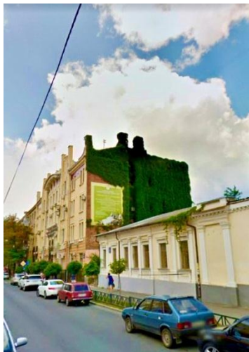
Fig. 2 – Building of NUPh, Kharkiv

Finally, it should be noted that videoecological issues should be addressed by involving municipal authorities and utilities, such as Kharkivblagoustriy, administrative (Kharkiv Regional Department of Forestry and Hunting) and production resources, involving modern scientific developments and using design fantasies to improve the urban environment. After all, it is very important to take into account a comprehensive approach to create a comfortable visual environment in the city of Kharkiv.