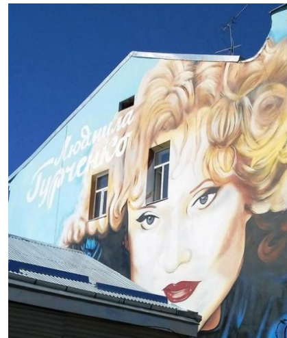
Fig. 3 – Portrait of Lyudmila Gurchenko [20]