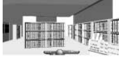
Fig. 2. Virtual Library

the levels containing several rooms: conference room, training room (Figure 1), library (Figure 2), lobby etc.