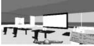
Fig. 1. Virtual Training Room