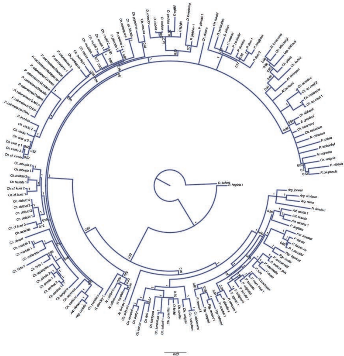
Figure 2. Phylogenetic reconstruction based on rps4-trnS and trnL-F . Posterior probability values are indicated on branches of the tree obtained by Bayesian inference.

the genera Pellaea and Cheilanthes (PP = 1; Fig. 2). Although, according to Eiserhardt et al. (2011), the divergence between Pellaea calomelanos and Cheilanthes viridis Sw. occurred about 10 million years ago, no differentiation at all occurred in P. calomelanos : as we can observe, all the individuals of the different populations of P. calomelanos (including those from Catalonia) are grouped in a well-supported clade (PP = 1) regardless of their origin, but without any kind of internal resolution. Not a single mutation (SNPs or indels) was found among the sequences of Pellaea calomelanos obtained for this study.