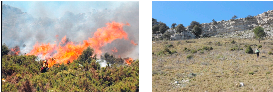
Figure 3. Tivissa plot during the first prescribed fire in 2006 (to the left , by Xavier Úbeda) and as seen nine years later during the most recent sampling event (to the right , by Meritxell Alcañiz).

this study is the same as that described for the Montgrí plot [30], comprising 42 sampling points within a plot, measuring 4 \times 18 m, within the burned area. Figure 3 show the view of the study site in 2006 and 2015. A sampling plot was established within the burned area using a grid structure ( 4 \times 18 m). Soil samples were collected after the prescribed fire at 42 points along three transects and along three lines running perpendicular to the central transect [30].