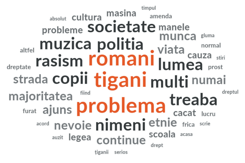
Figure 1. Most common 40 words in Romanian.

Figure 1 shows, through a word cloud, the distribution of the 40 most common Romanian words<sup>3</sup> employed by the users of Reddit Romania (N = 4,136), these being in English: Gypsies, Romanian, problem, many, children, the police, the world, no one, racism, the music, society, [to have] trouble, life, most of them, made, ethnicity, the work, need, continue, no more, the street, the cause, shit, problems, school, Manele [music attributed to the Roma], car, culture, the law, fear, fine [punishment], justice, work, normal, dumbass, otherwise, stealing, agreement, being, news, the home, write, [to be] serious, heard, [to be] right, [to have] the right, joke, time, the Gypsies, and absolute.