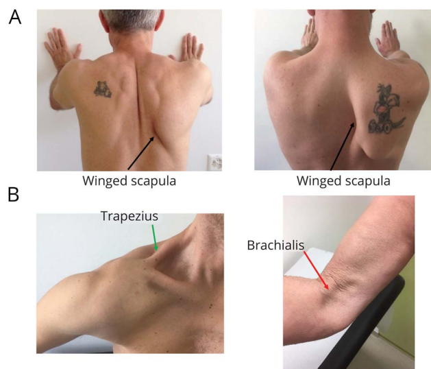
(A) In bilateral HEV-NA cases (above), winged scapula (black arrows) is recurrent and often asymmetrical. (B) In unilateral HEV-NA cases (below), amyotrophy is often very focal, affecting one muscle and sparing the neighboring muscle (left: involvement of the upper trapezius = green arrow, deltoid spared; right: brachialis muscle affected = red arrow, biceps brachii spared). HEV = hepatitis E virus; NA = neuralgic amyotrophy.

Two patients with unilateral HEV-NA did not receive any immunomodulatory treatment because they had minor weakness. Regarding the remaining HEV-NA cases, they were treated within 10 days from onset either with intravenous immunoglobulin (IVIg) 0.4 g/kg/d for 5 days in cases of bilateral involvement ( n = 9 ) or with oral prednisone 60 mg/d \times 7 days, with tapering in 7 days in cases of unilateral weakness ( n = 4 ), as previously reported in a retrospective study. 30