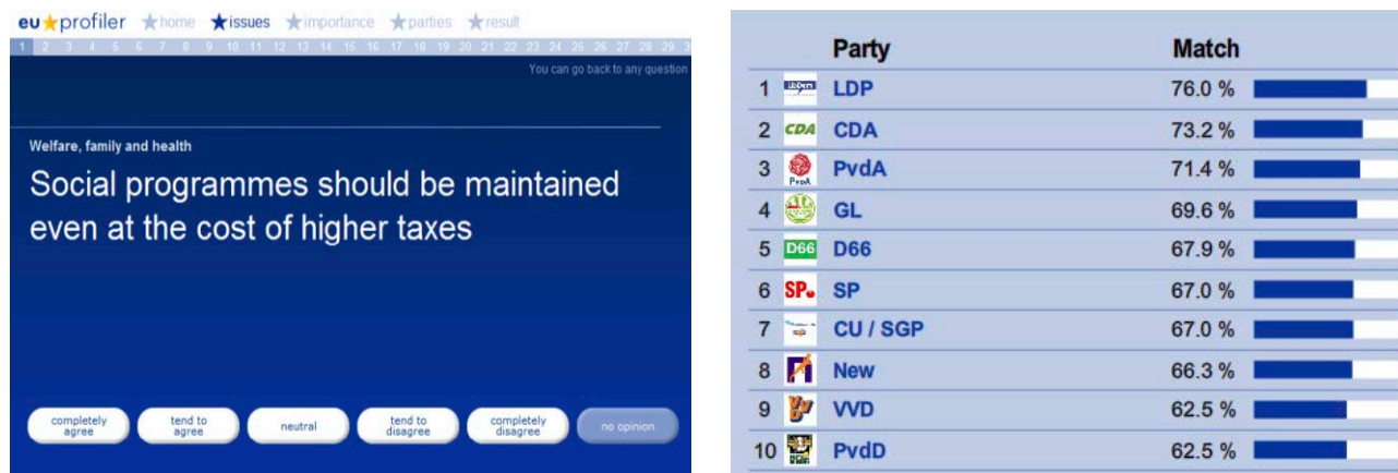
Fig. 1. Example of a VAA statement (L); the 'voting advice' provided in the results screen (R).

tion produces a "voting advice", usually in the form of a rank-ordered list, at the top of which stands the party closest to the user's policy preferences (see Figure 1, right) 3 .