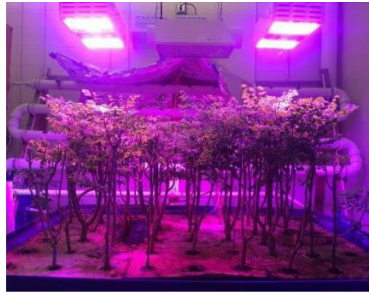
Figure 1: The Moringa Oleifera trees growing under reduced artificial

normalized dry leaves weight produced by each tree to be 0.224 grams/tree.